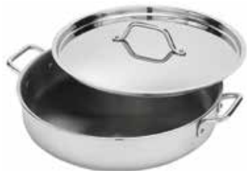
PAELLA PAN 8460-60/40A 10.0 qt./ 9.5 L 15.75" Dia. x 3.5"H