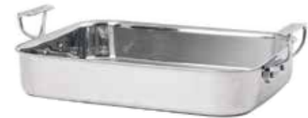
ROASTING PAN 6 QT. 8165-60 6.0 qt./ 5.7 L 15.5"W x 12.0"D x 3.0"H (17.25"W x 4.75"H w/ handles)