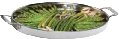
OVAL SAUTE PAN 2 SHORT HANDLES 8188-60/38 1.5 qt./ 1.42 L 19.0"W x 10.5"D x 1.75"H