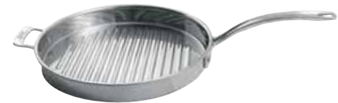
GRIDDLE W/RIBBED BOTTOM 8168-60/30 2.0 qt./ 1.9 L 12.0" Dia. x 1.5"H