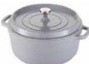
4.7 QT. GRAY 8658-9/28 11" Dia. X 7.13"H 4.7 qt. / 4.45 L 5.4 lbs.