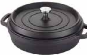
2.7 QT. BLACK ONLY 8656-8/28 11" Dia. X 2.4"H 2.7 qt. / 2.6 L 5 lbs.