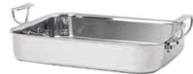
ROASTING PAN 3 QT. 8165-63 3.0 qt./ 2.8 L 13.0"W x 9.25"D x 2.5"H (14.5"W x 4.25"H w/ handles)