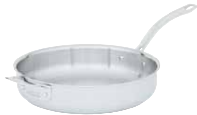
ROUND SAUTE PAN 8170-60/30 5.0 qt./ 4.7 L 12.0" Dia. x 2.75"H