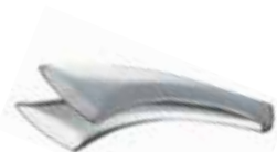
MULTI-PURPOSE TONGS One piece material holds its shape and is easy to clean