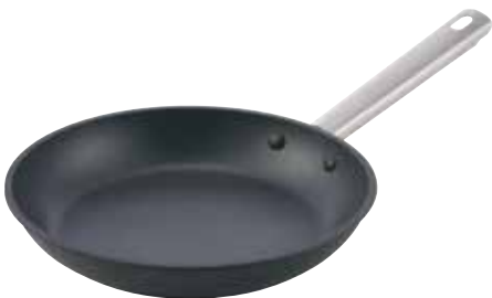
FRY PAN 8451-30/20 7.875" Dia. x 1.25"H