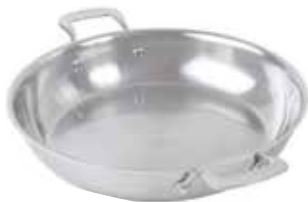
GRATIN PAN-12" 8456-60/30 4.0 qt./ 3.8 L 12" Dia. x 1.63"H