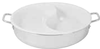
OVAL SAUTE PAN 1 LONG, 1 SHORT HANDLE 8181-60/38 1.5 qt./ 1.42 L 11"W x 10"D x 1.75"H