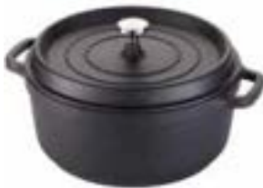
4.7 QT. BLACK 8658-8/28 11" Dia. X 7.13"H 4.7 qt. / 4.45 L 5.4 lbs.