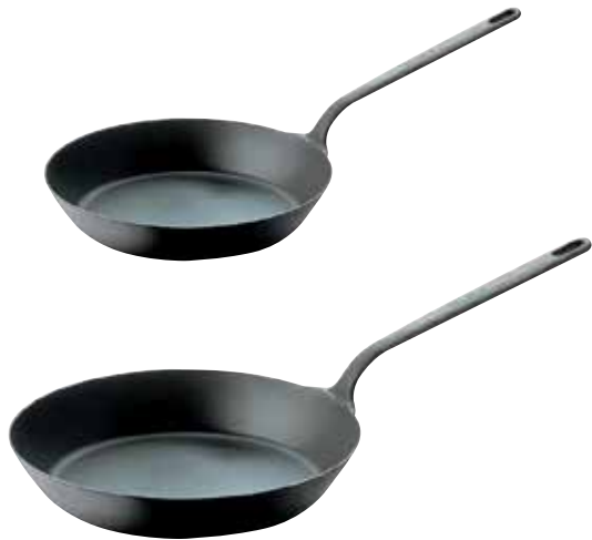
8481-40/20 8.63" Dia. x 1.75"H