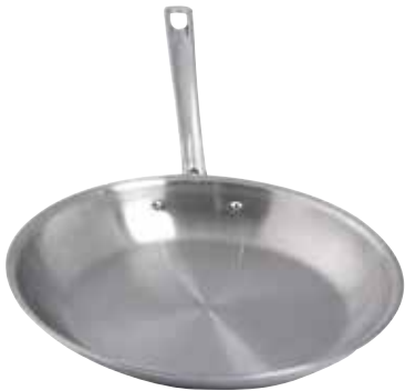
FRY PAN 8186-60/20 8" Dia. x 1.38"H