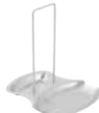
TONGS W/ CLAWS 10.5" 9385*3