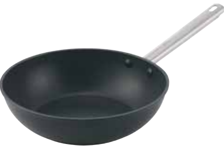
FLAT BOTTOM WOK PAN 8452-30/28 11" Dia. x 3.0"H