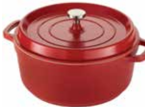
4.7 QT. RED 8658-5/28 11" Dia. X 7.13"H 4.7 qt. / 4.45 L 5.4 lbs.