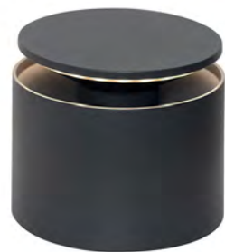
LD1050N3 Dark Grey