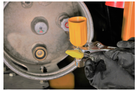
Install coupler on propane valve with a wrench