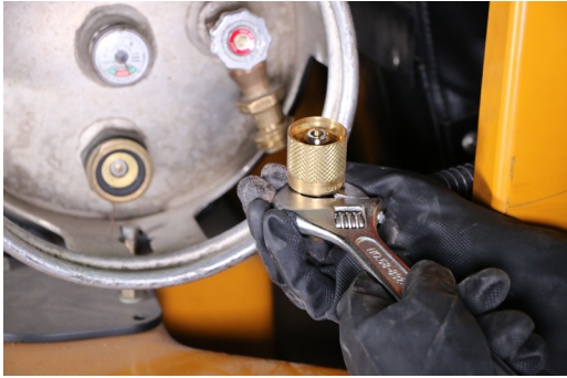
Use wrench to remove existing propane coupler

Start by wrapping LPG Tape included around the thread of the valve