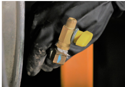
Install Valve onto propane line