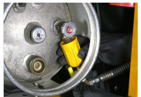
Then twist off the coupler from cylinder