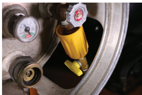
To change propane cylinder: Turn off the valve not allowing any propane in the line to get through