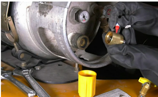
Add glue to coupler and safety grip