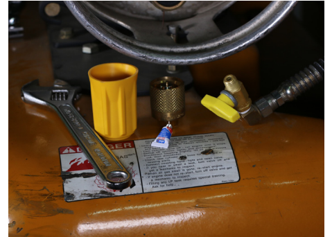
Tighten with a wrench