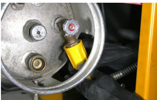
Twist on coupler to propane cylinder and turn on the valve