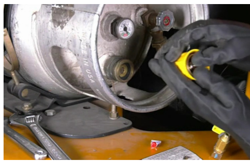
Push coupler through safety grip