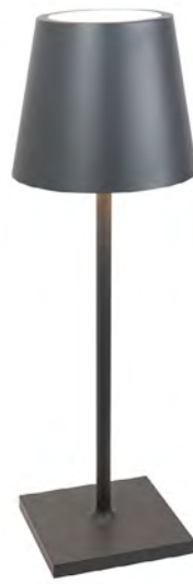
LD0395N4 Dark Grey