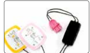
Infant/Child Reduced Energy Defibrillation electrodes with the pink cable connector deliver attenuated energy to children less than 8 years of age or less than 25 kg