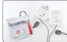
Adult QUIK-COMBO electrodes with REDI-PAK Preconnect System