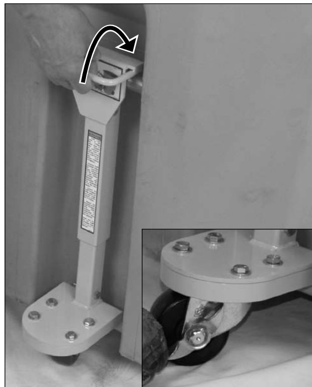
3) Secure the top hook of the Troll® EZ Wheel™ over the bar on the container. ALWAYS set the brake when the container is unattended or remove the Troll® EZ Wheel™ from the container.