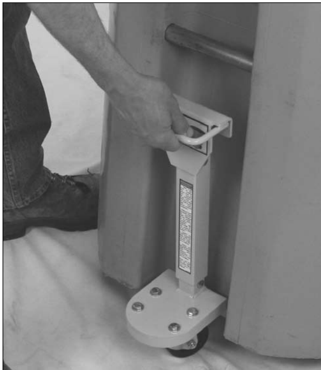
1) Place the lower hook of the Troll® EZ Wheel™ under the front edge of the container.