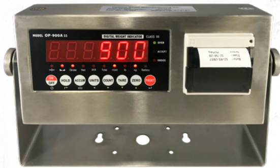
OP-900P BUILT-IN PRINTER