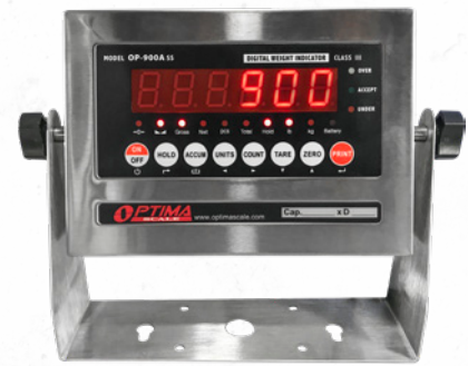
OP-900A-SS LED STAINLESS STEEL