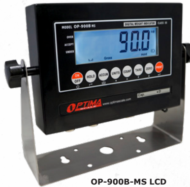
OP-900B-MS LCD PAINTED CARBON STEEL