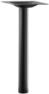
Column/Spider x1 1PC