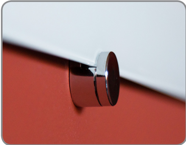
Stainless steel mounting pucks