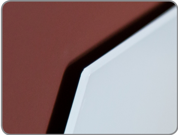
Made of tempered .25" (6mm) thick glass