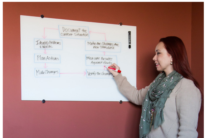
WGB3624M - 36" x 24"

2245 Delany Road, Waukegan, IL 60087 800-323-4656 | Fax 847-244-1818 | www.LuxorFurn.com