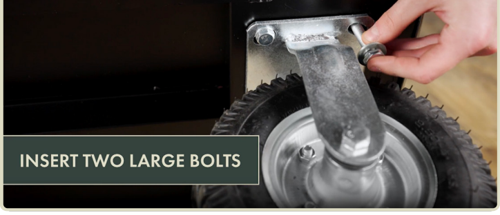
continued on next page

Flip the base over onto the casters and insert two large bolts with fasteners into large hole. Screw in one of the sides and fasten with a wrench. Put the 2 metal circles underneath each side bar handle on the carpet.