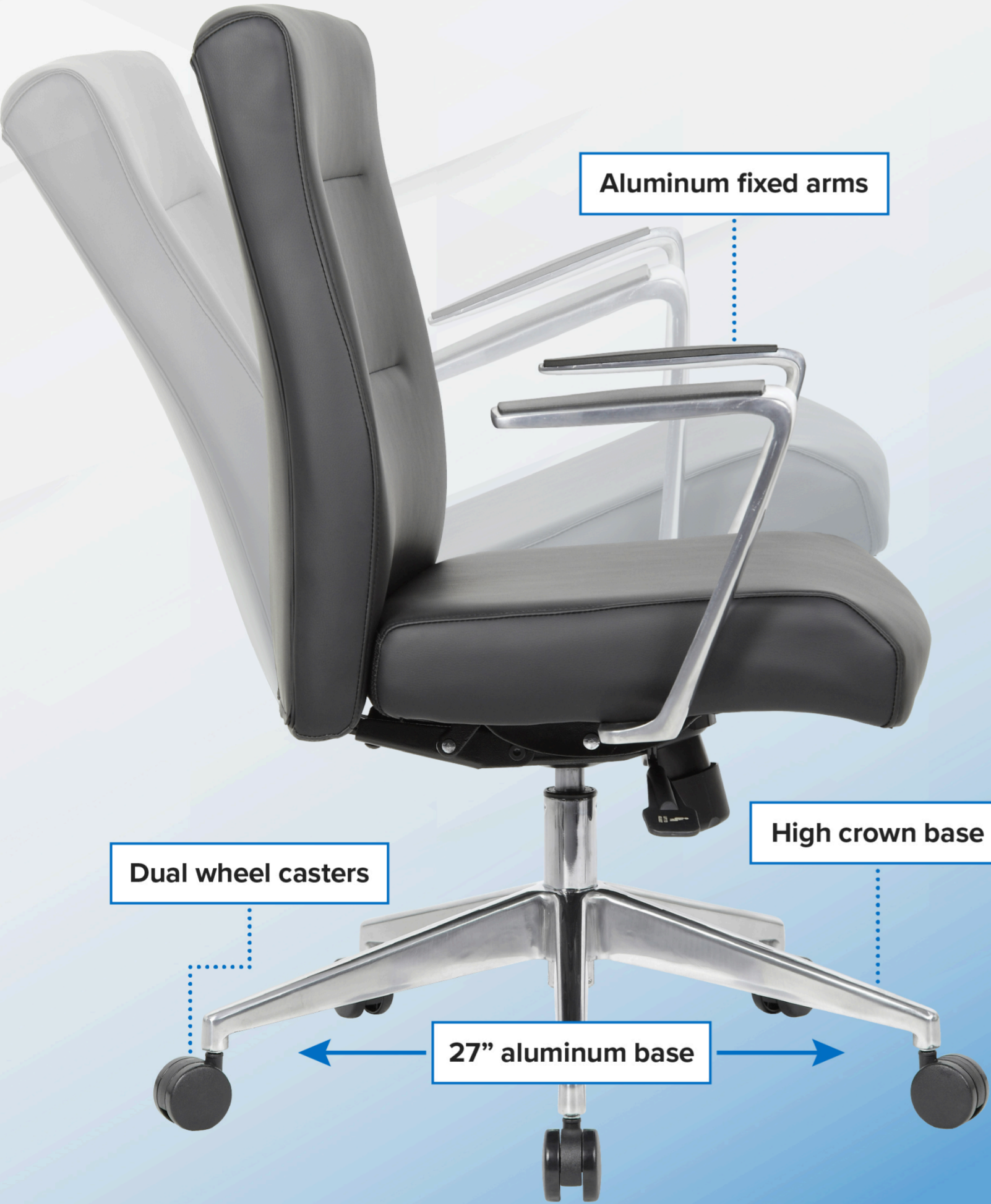
Aluminum fixed arms