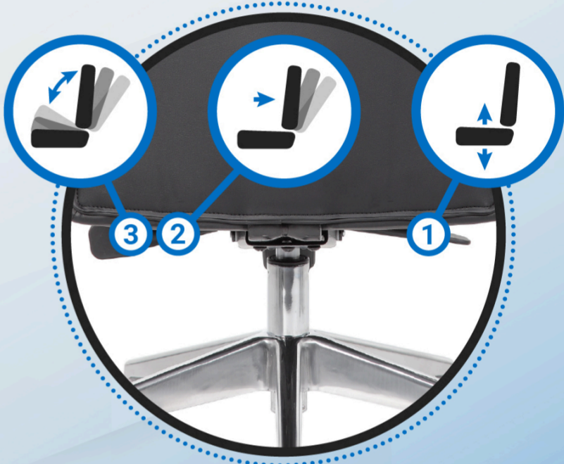
Pneumatic gas lift height adjustment, any position lock, and synchro-tilt mechanism