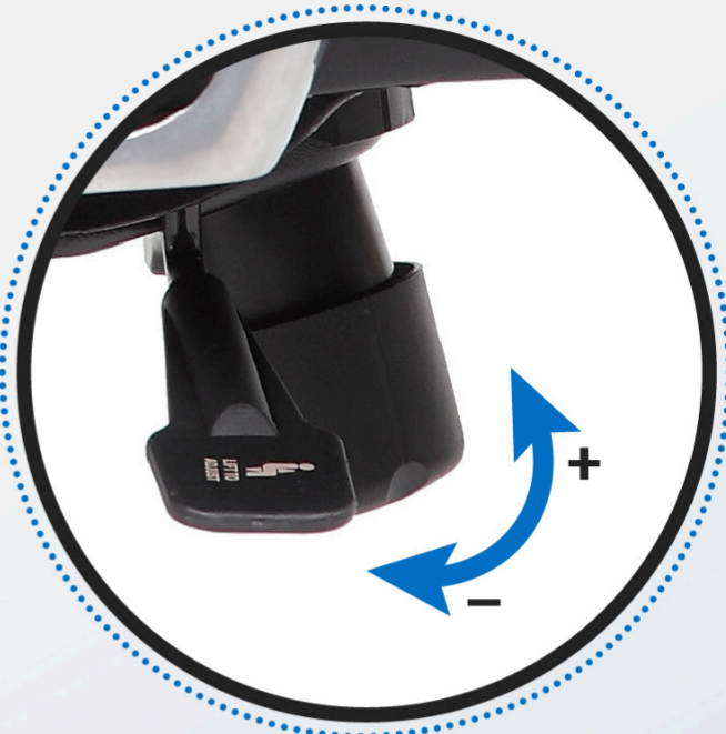
Tilt tension knob