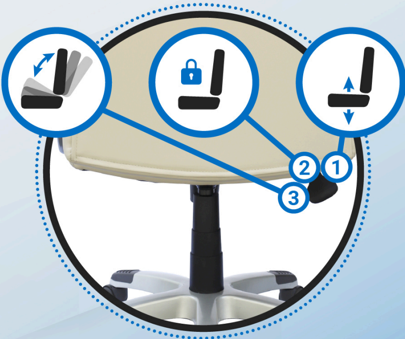
Pneumatic gas lift height adjustment, upright locking position, and spring tilt