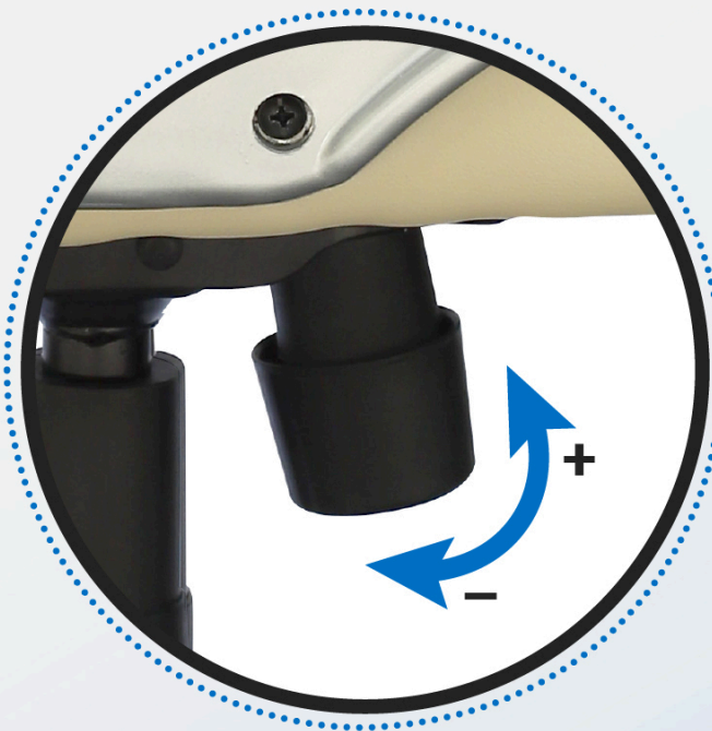
Tilt tension knob