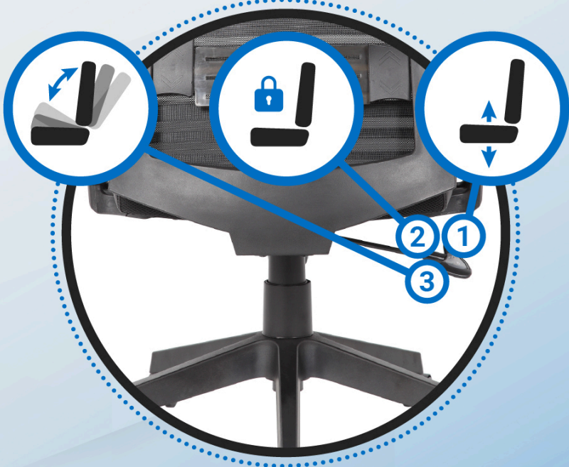
Pneumatic gas lift height adjustment, upright locking position, and synchro-tilt mechanism