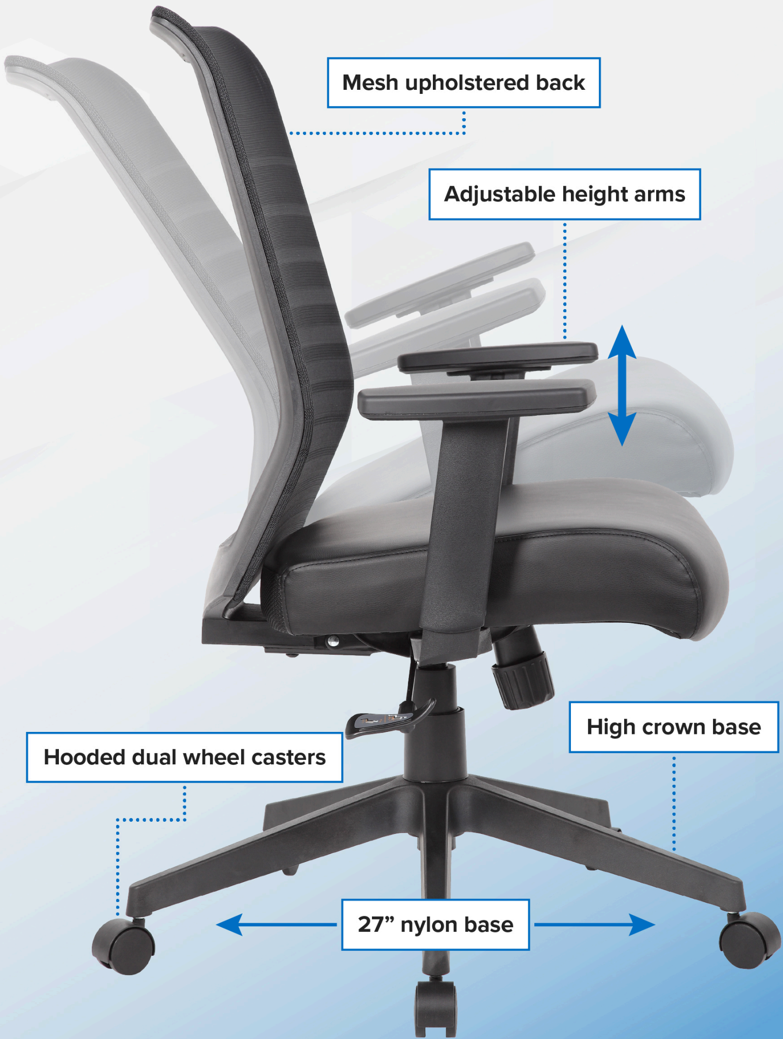
Mesh upholstered back