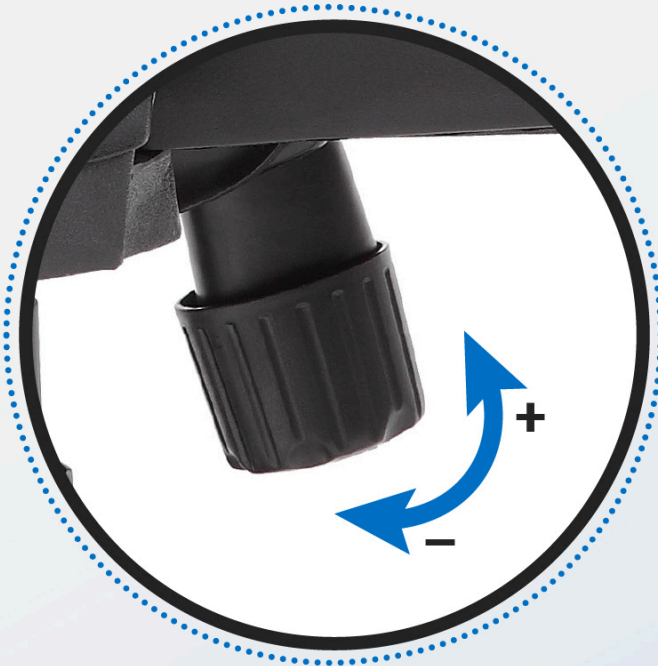
Tilt tension knob