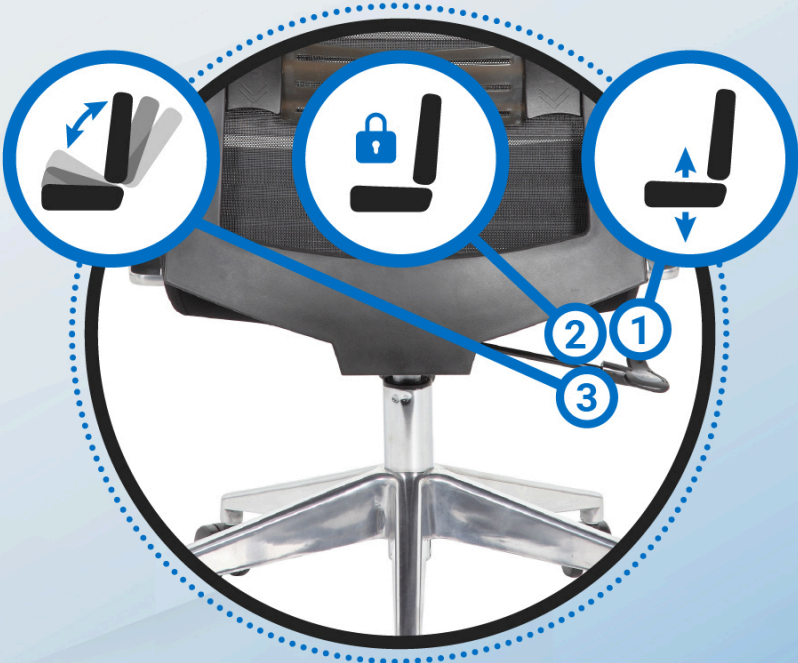
Pneumatic gas lift height adjustment, upright locking position, and synchro-tilt mechanism