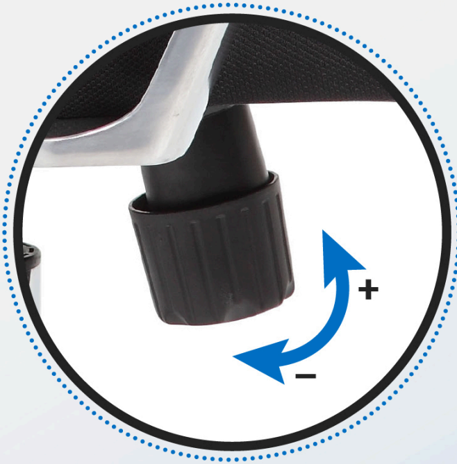
Tilt tension knob