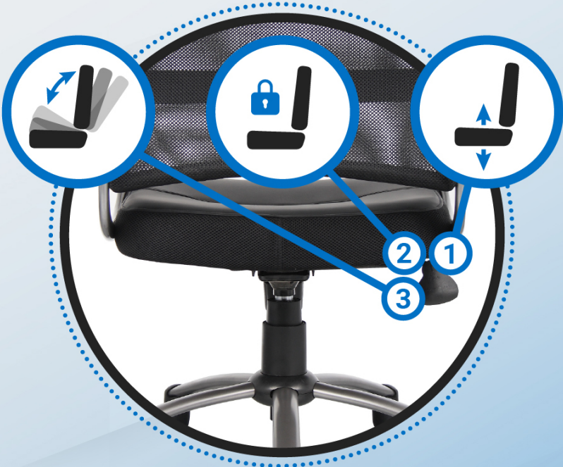
Pneumatic gas lift height adjustment, upright locking position, and spring tilt