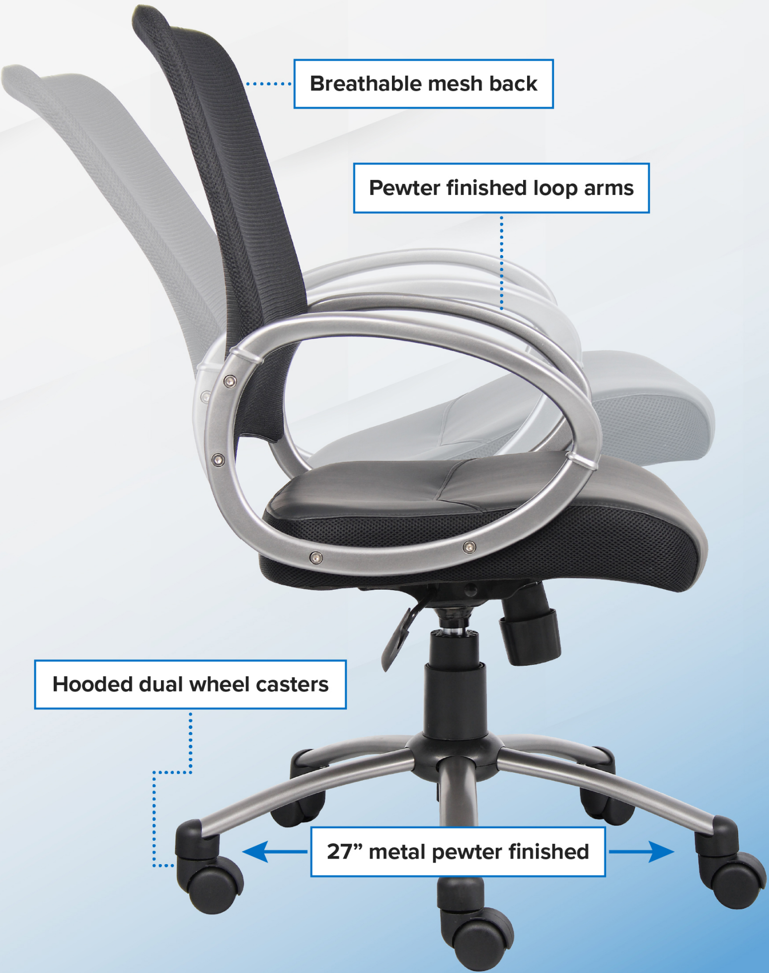
Breathable mesh back