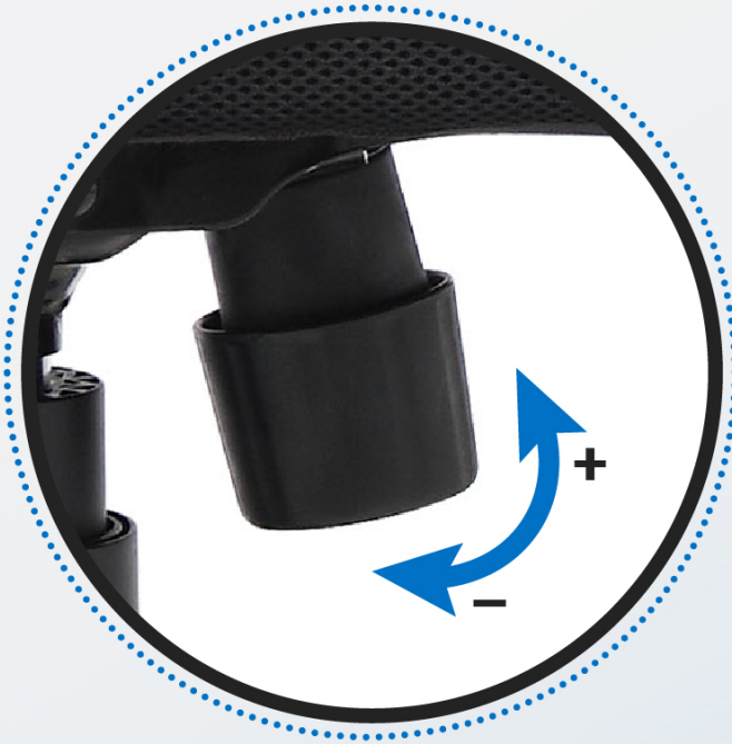
Tilt tension knob