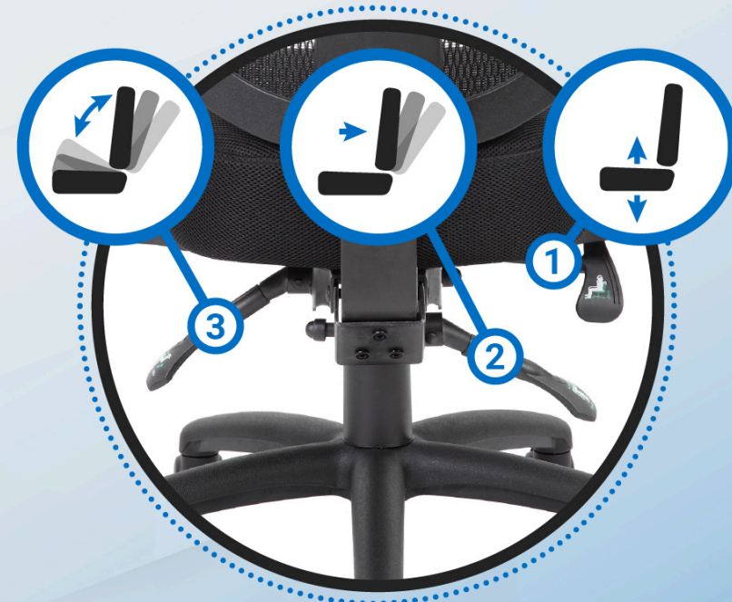
Pneumatic gas lift height adjustment, any position lock, and spring tilt mechanism