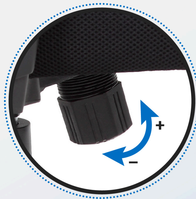
Tilt tension knob