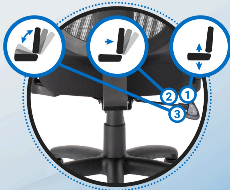
Pneumatic gas lift height adjustment, any position lock, and synchro-tilt mechanism