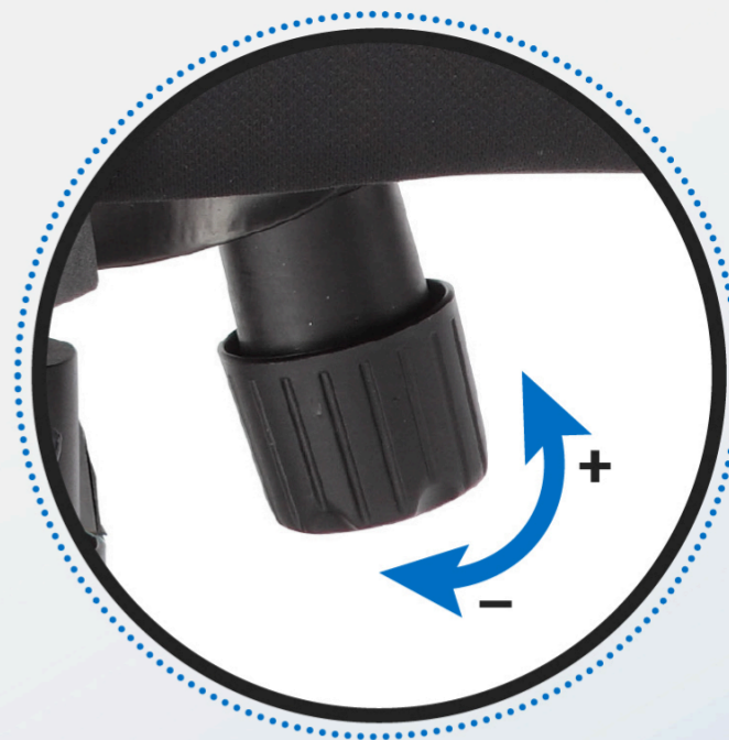
Tilt tension knob