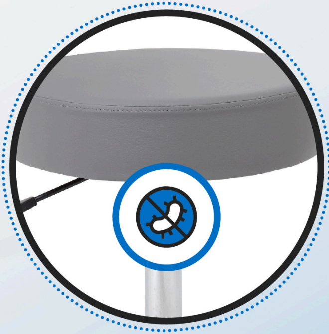
Antimicrobial caressoft upholstered cushion