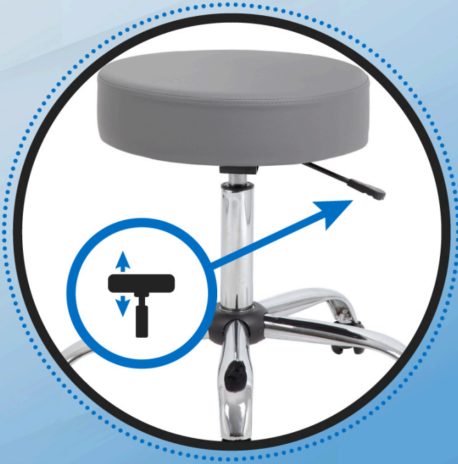
Pneumatic gas lift height adjustment