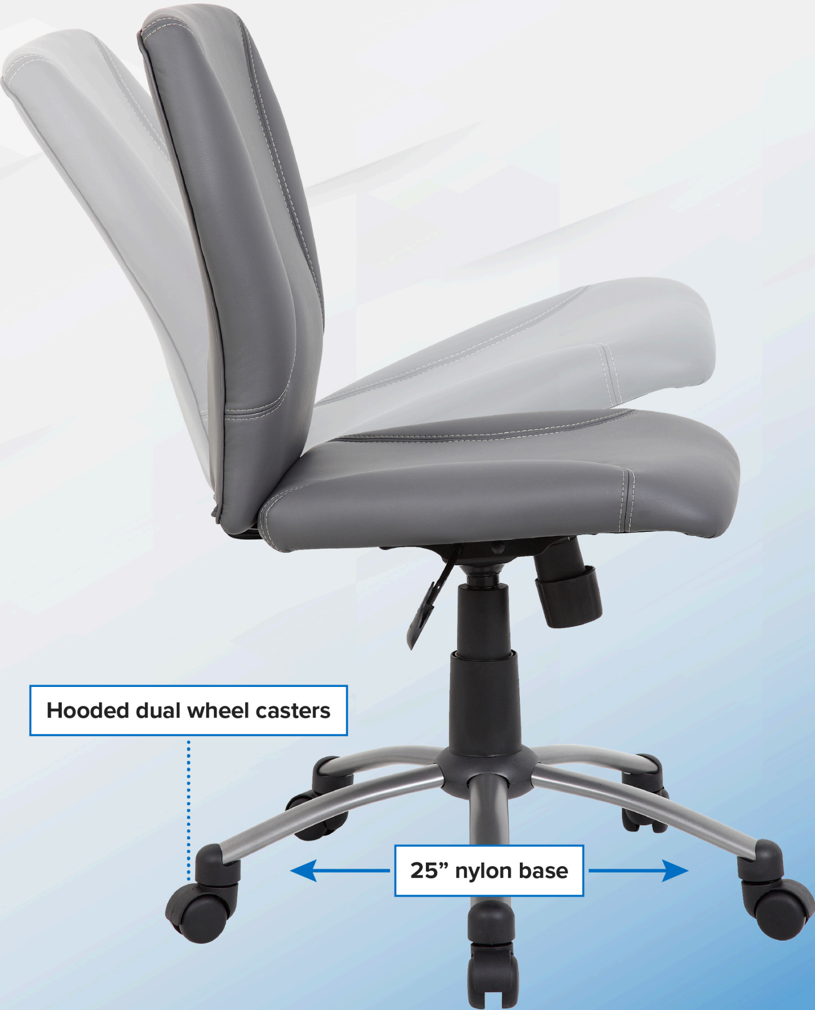
Hooded dual wheel casters