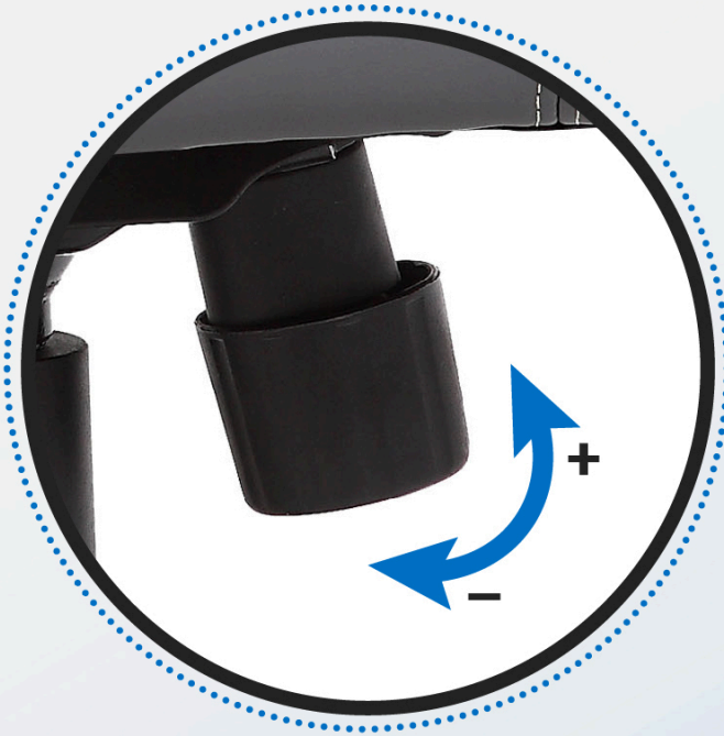
Tilt tension knob