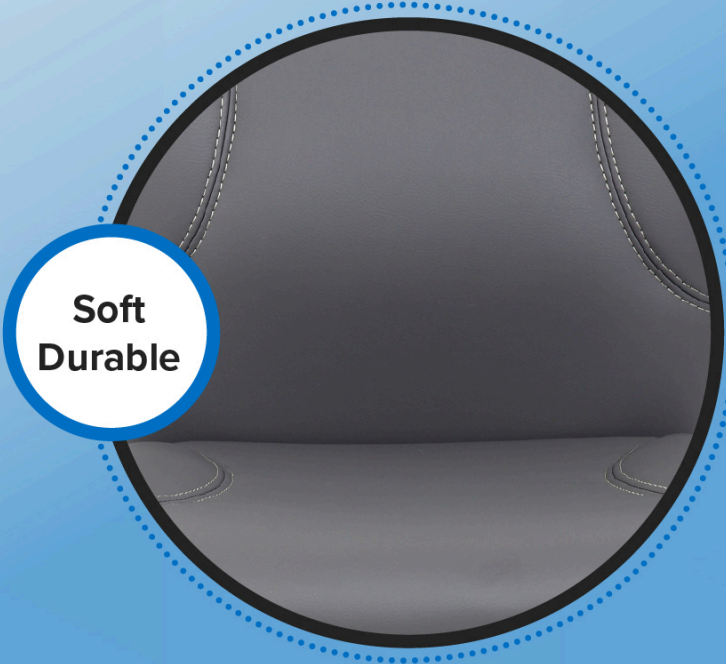
CaressoftPlus™ with double stitching