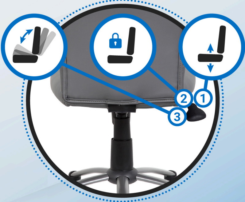
Pneumatic gas lift height adjustment, upright locking position, and spring tilt