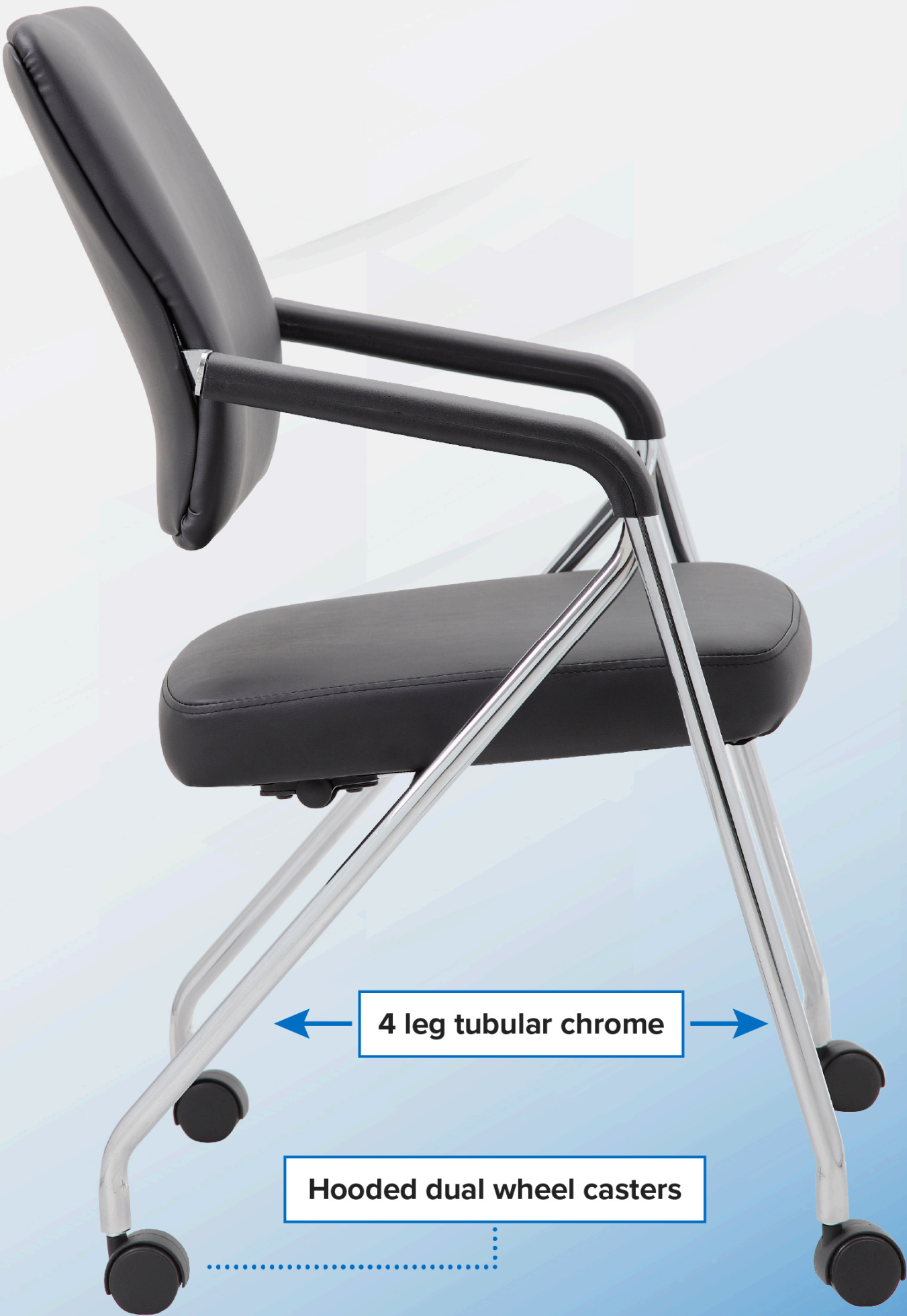
4 leg tubular chrome