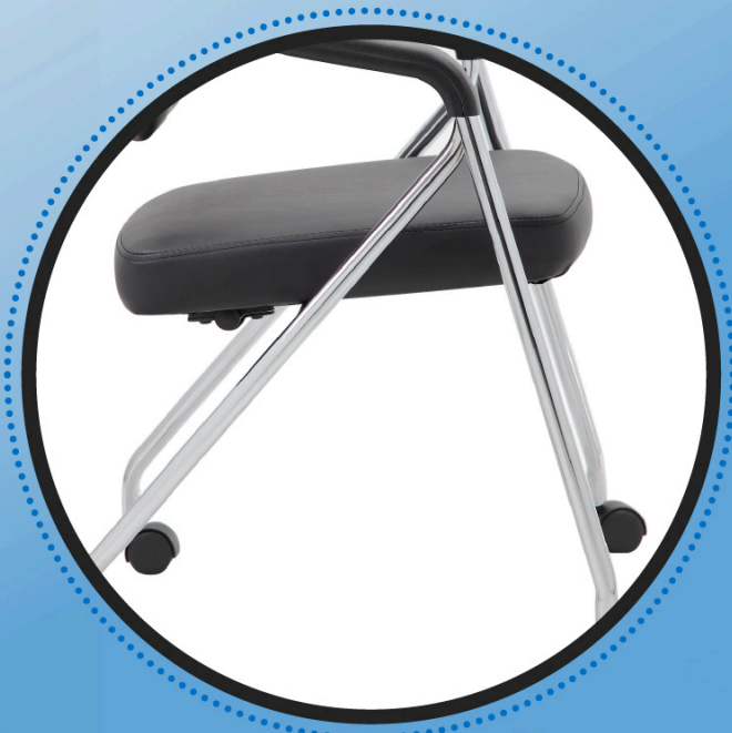
Sturdy metal frame with chrome finish