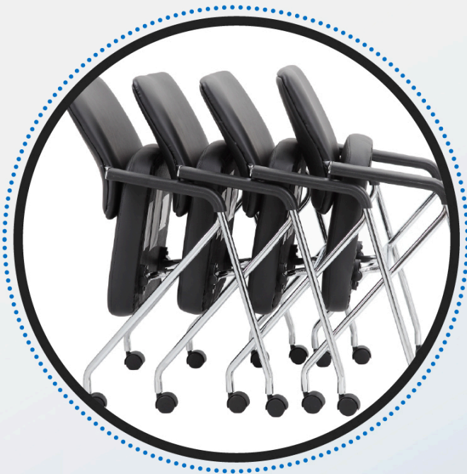
Fold for easy storage