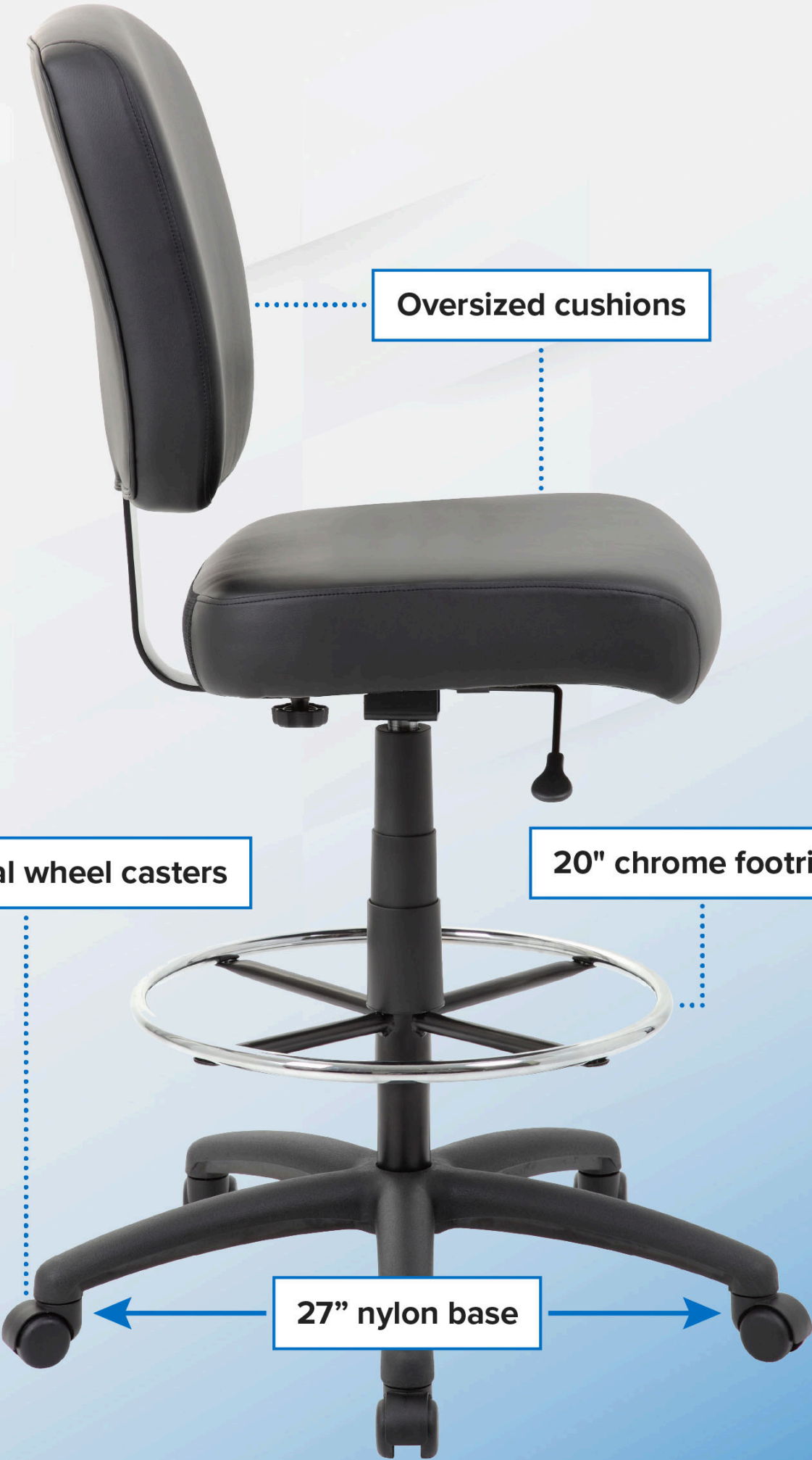
Hooded dual wheel casters