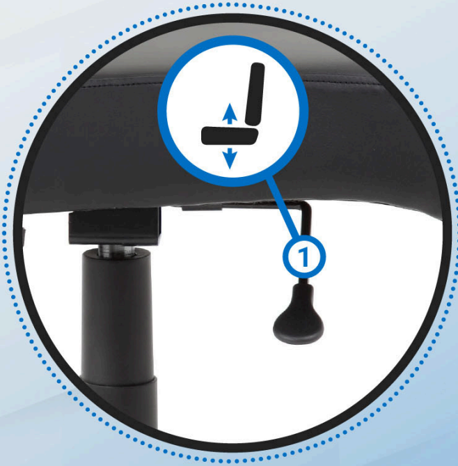
Pneumatic gas lift height adjustment