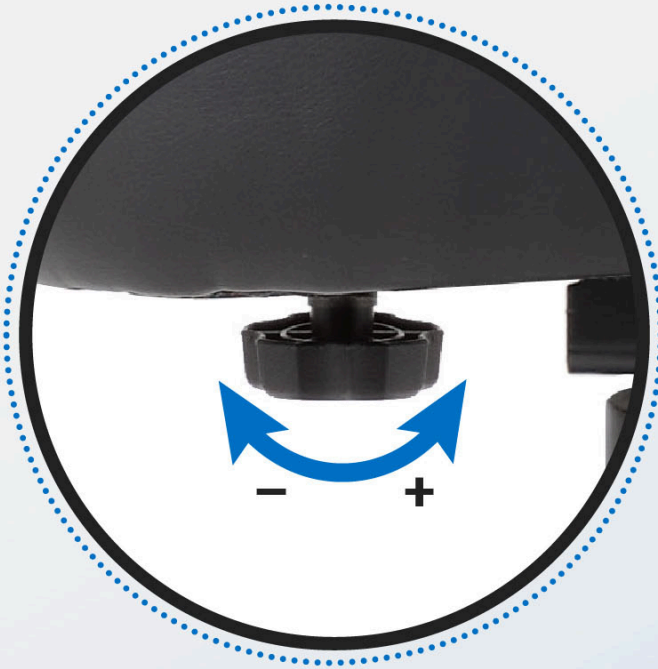
Back adjustment knob