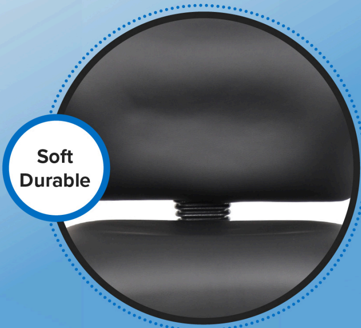
Black LeatherPlus upholstery