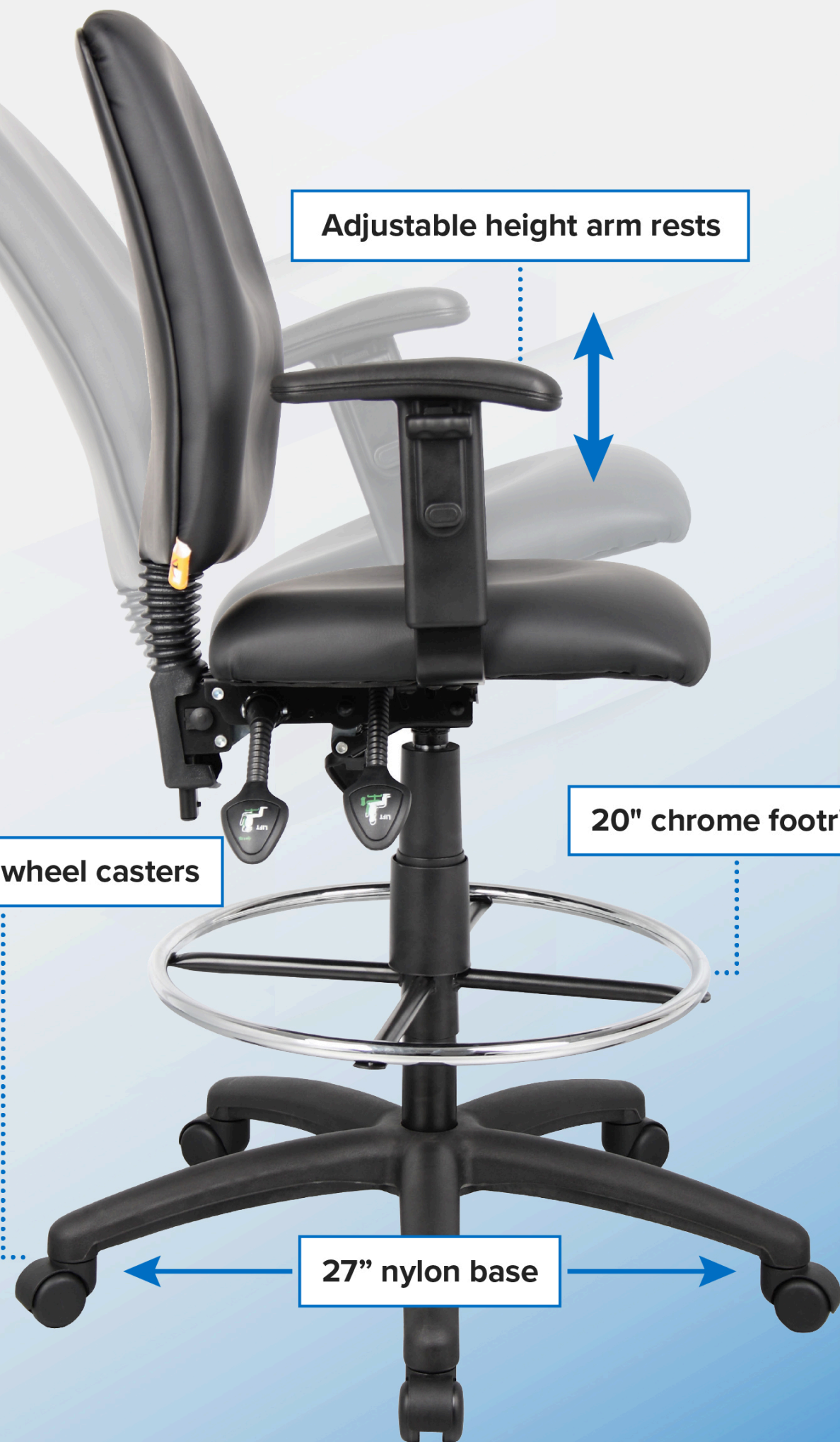
27" nylon base