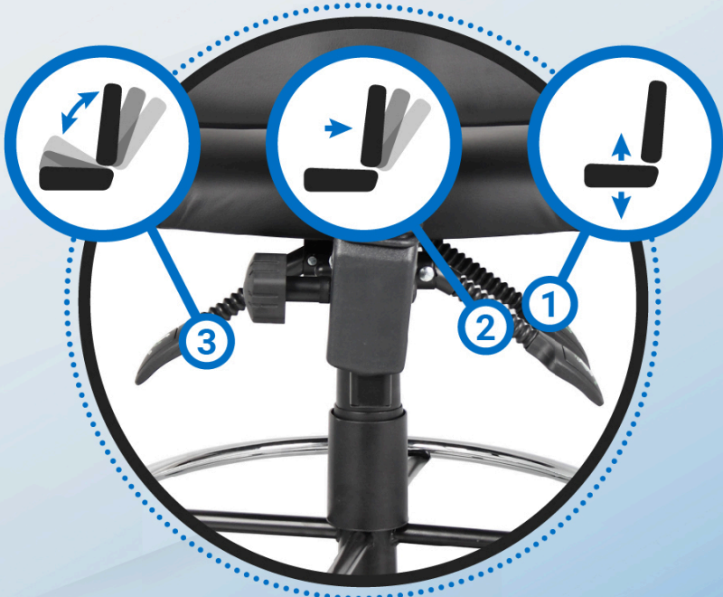
Pneumatic gas lift height adjustment, any position lock, and spring tilt mechanism