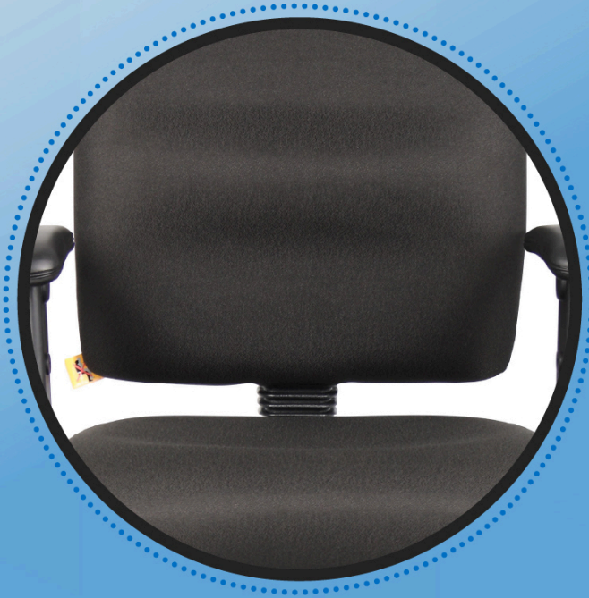
Crepe fabric upholstery