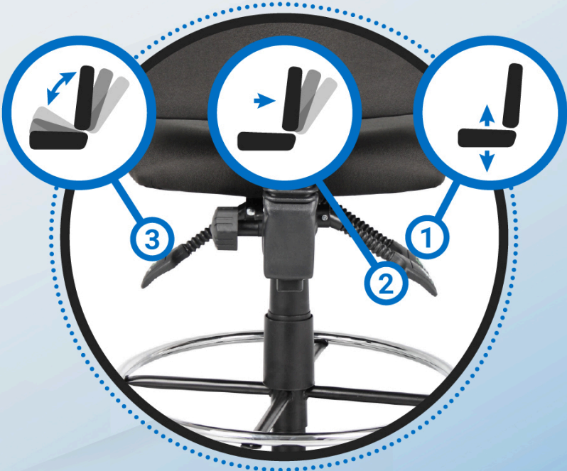
Pneumatic gas lift height adjustment, any position lock, and seat tilt lock mechanism