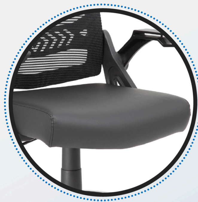
Upholstered seat cushion