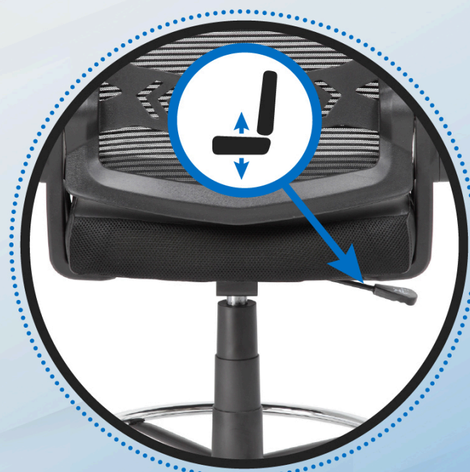
Pneumatic gas lift height adjustment