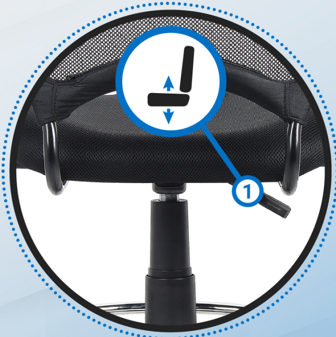
Pneumatic gas lift height adjustment