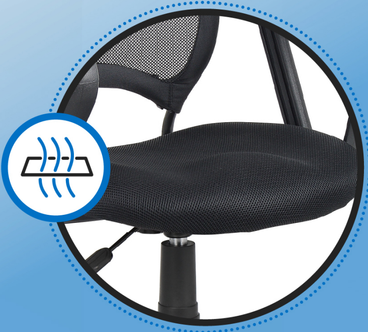
Breathable mesh fabric seat