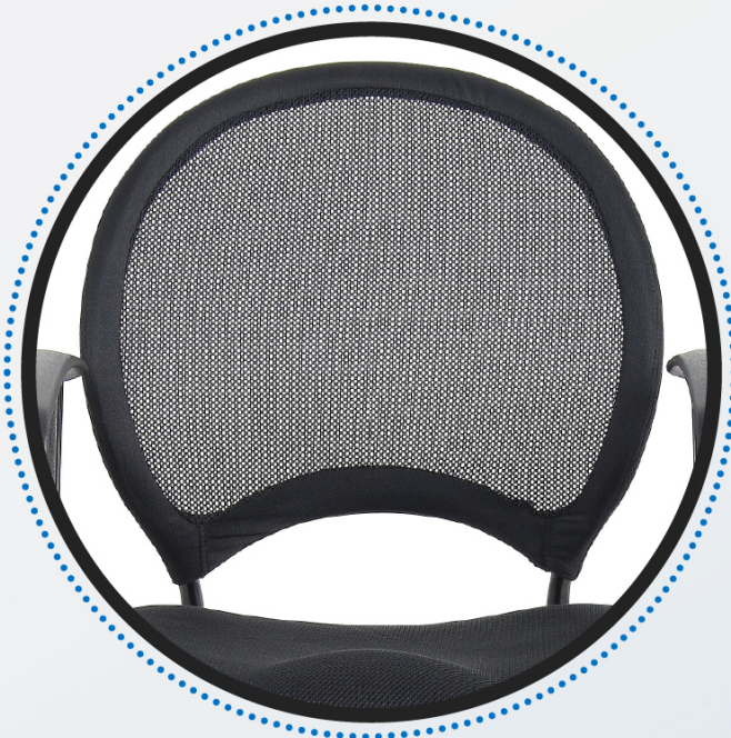
Open mesh back w/ solid metal frame