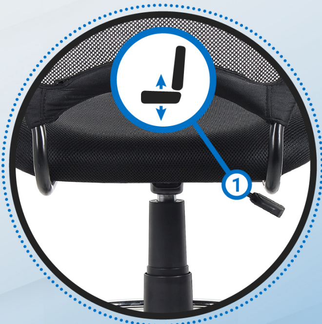
Pneumatic gas lift height adjustment