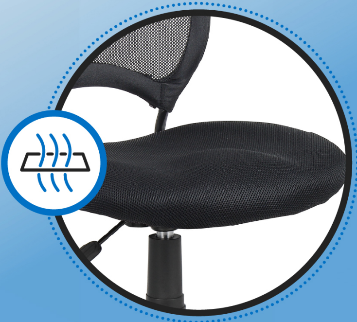
Breathable mesh fabric seat