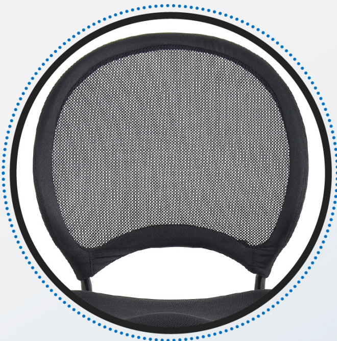
Open mesh back w/ solid metal frame