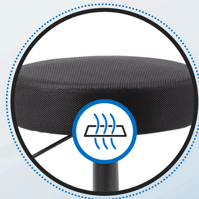
Breathable mesh upholstered cushion