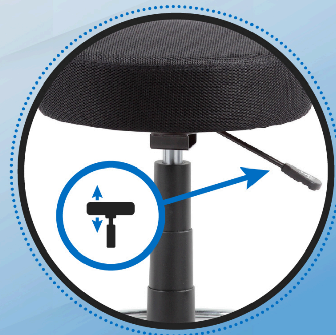
Pneumatic gas lift height adjustment