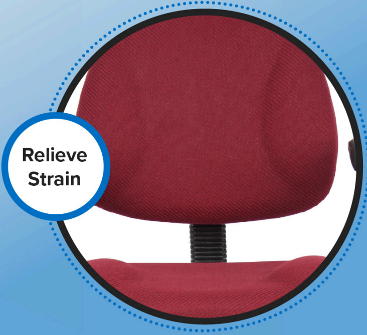
Contoured back and seat cushion