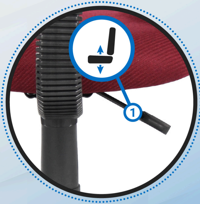
Pneumatic gas lift height adjustment