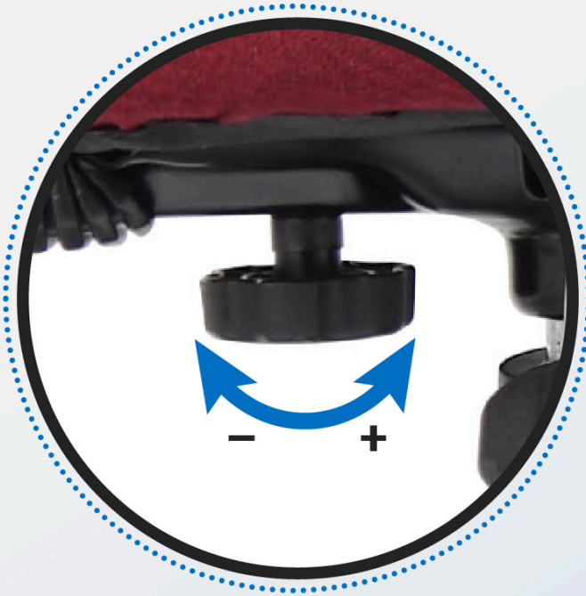
Back adjustment knob