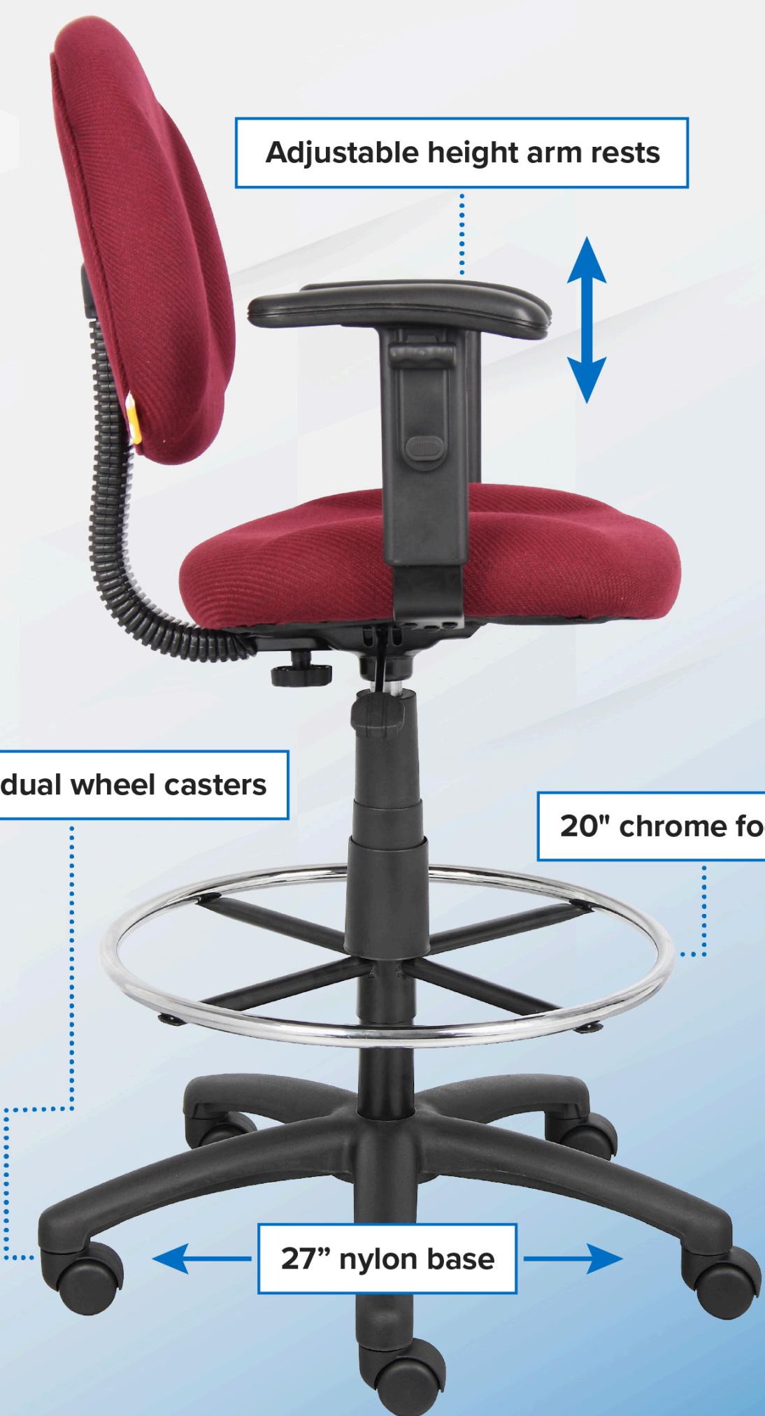
Adjustable height arm rests