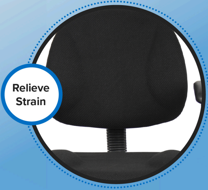
Contoured back and seat cushion