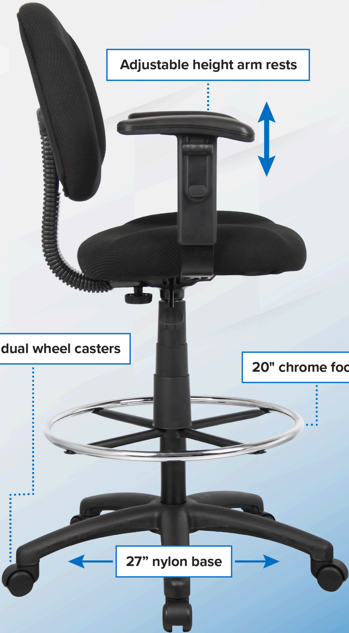
Adjustable height arm rests