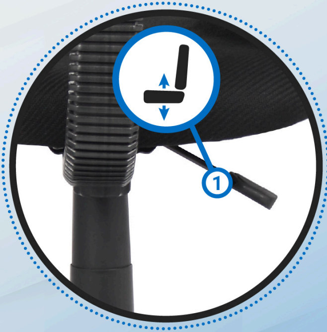
Pneumatic gas lift height adjustment