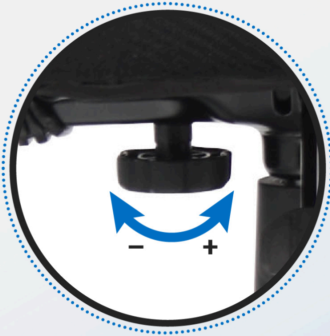
Back adjustment knob