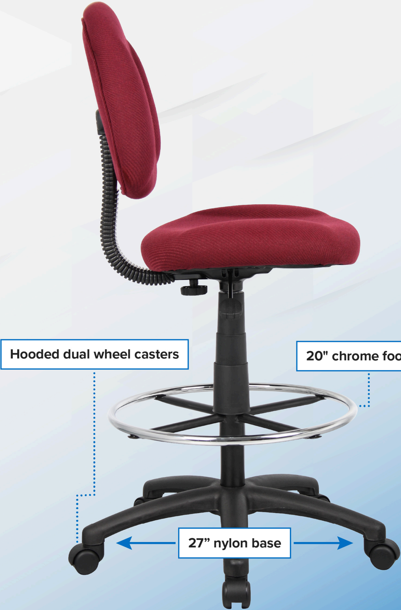
Hooded dual wheel casters