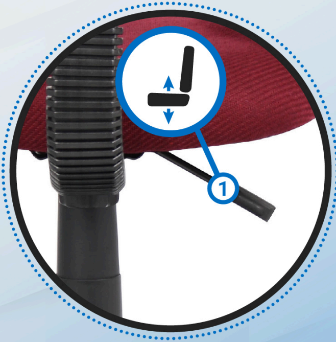
Pneumatic gas lift height adjustment