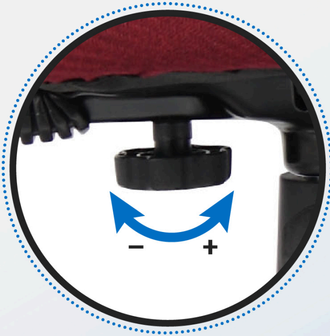
Back adjustment knob