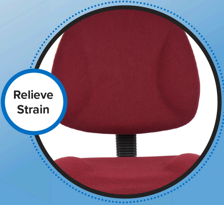
Contoured back and seat cushion