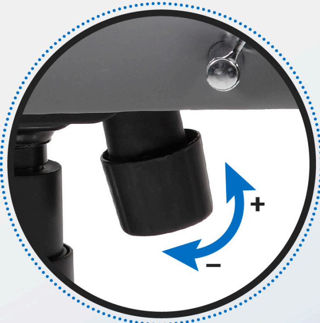
Tilt tension knob