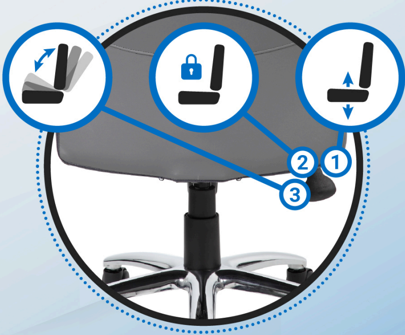
Pneumatic gas lift height adjustment, upright locking position, and spring tilt