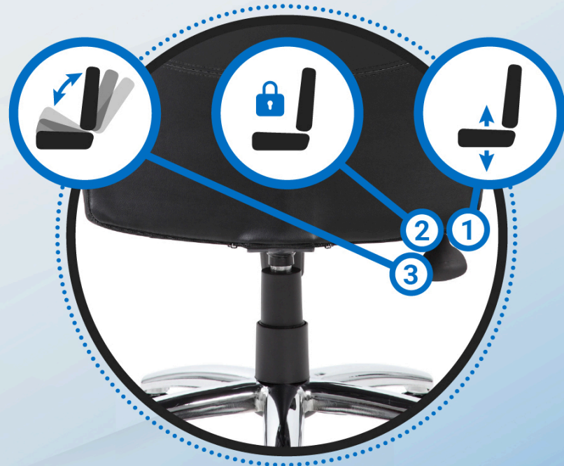
Pneumatic gas lift height adjustment, upright locking position, and spring tilt