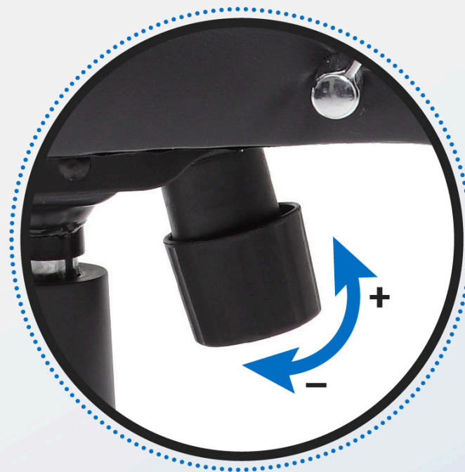
Tilt tension knob