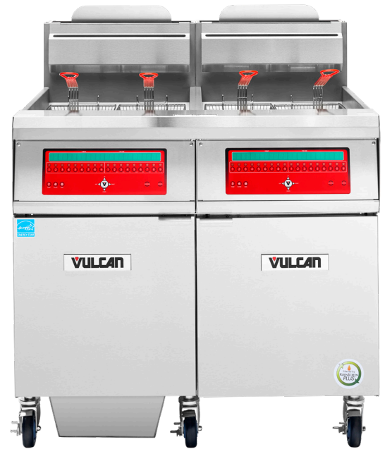
2VHG70CF - Solid State Computer Controls with KleenScreen PLUS® filtration