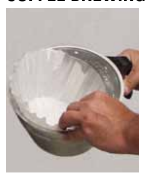
STEP 1 Insert a BUNN® filter into the funnel.