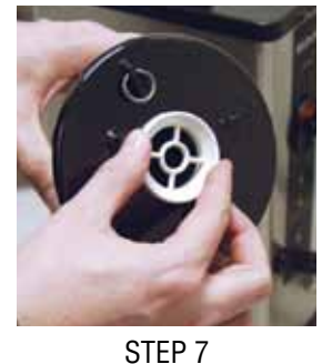
Unscrew the inlet cap.