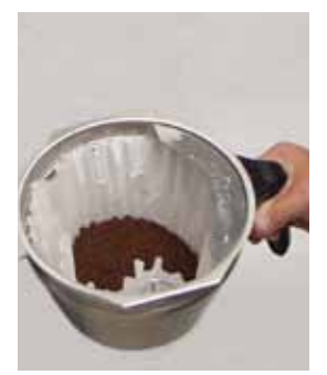
Level grounds by gently shaking.