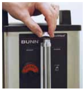
Reinstall glass tube and the sight gauge cap.