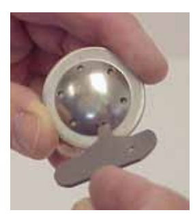
STEP 2 Clean mineral deposits and rinse. Using the deliming tool, make sure all holes are open.