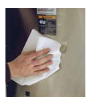
STEP 4 Use a clean damp cloth rinsed in nonabrasive, mild detergent to clean all surfaces.