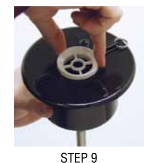
Rinse well. Reassemble the lid making sure to replace the retainer cap.