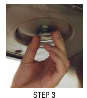
Reinstall the sprayhead.