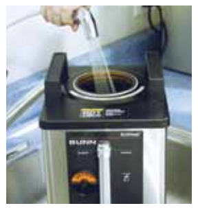
STEP 14 Thoroughly rinse entire Use a clean damp cloth inside of the server. DO NOT immerse server in water.