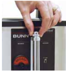
Make sure reservoir is empty and unscrew the sight gauge cap.