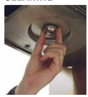
STEP 1 Remove the sprayhead.