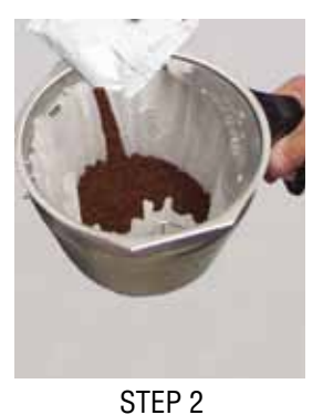
Pour the proper amount of fresh coffee into the funnel.