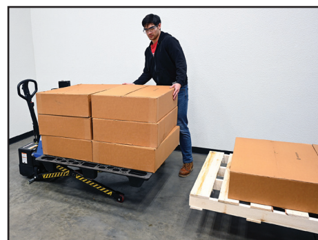
Photo Eye Sensor