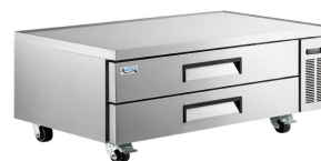
52" Base • 2 Drawers