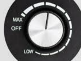
Precise variable speed control