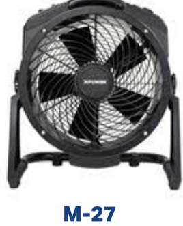
M-27 Air Neutralizing Fan