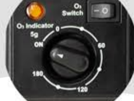
Industrial ozone generator on/off switch & 3 hr timer