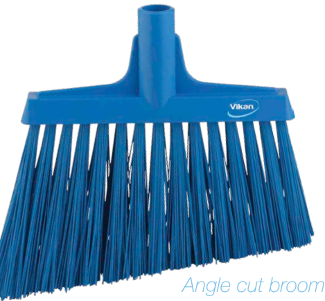
Angle cut broom