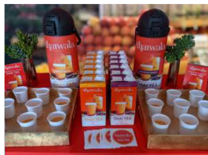
In-store demo setup