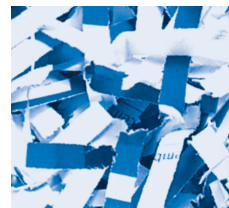
Level P-3 Cross-Cut