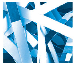
Level P-2 Strip-Cut