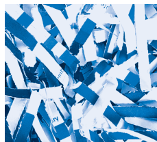
Level P-4 Super Cross-Cut