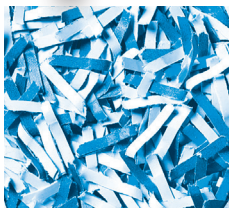
Level P-5 Micro-Cut