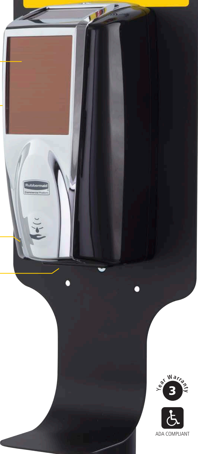
1980826 / FG750824