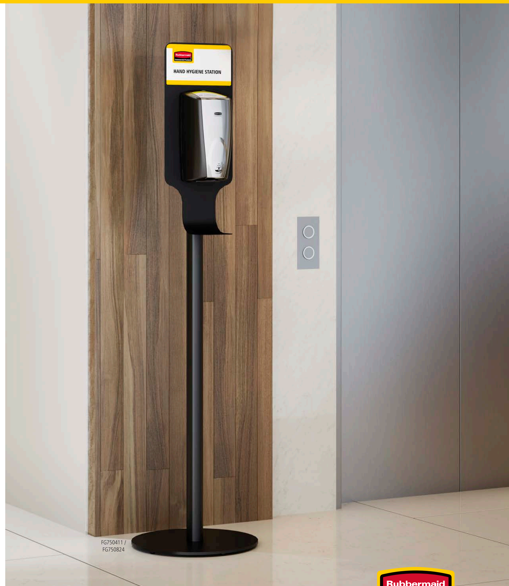
FG750411 / FG750824