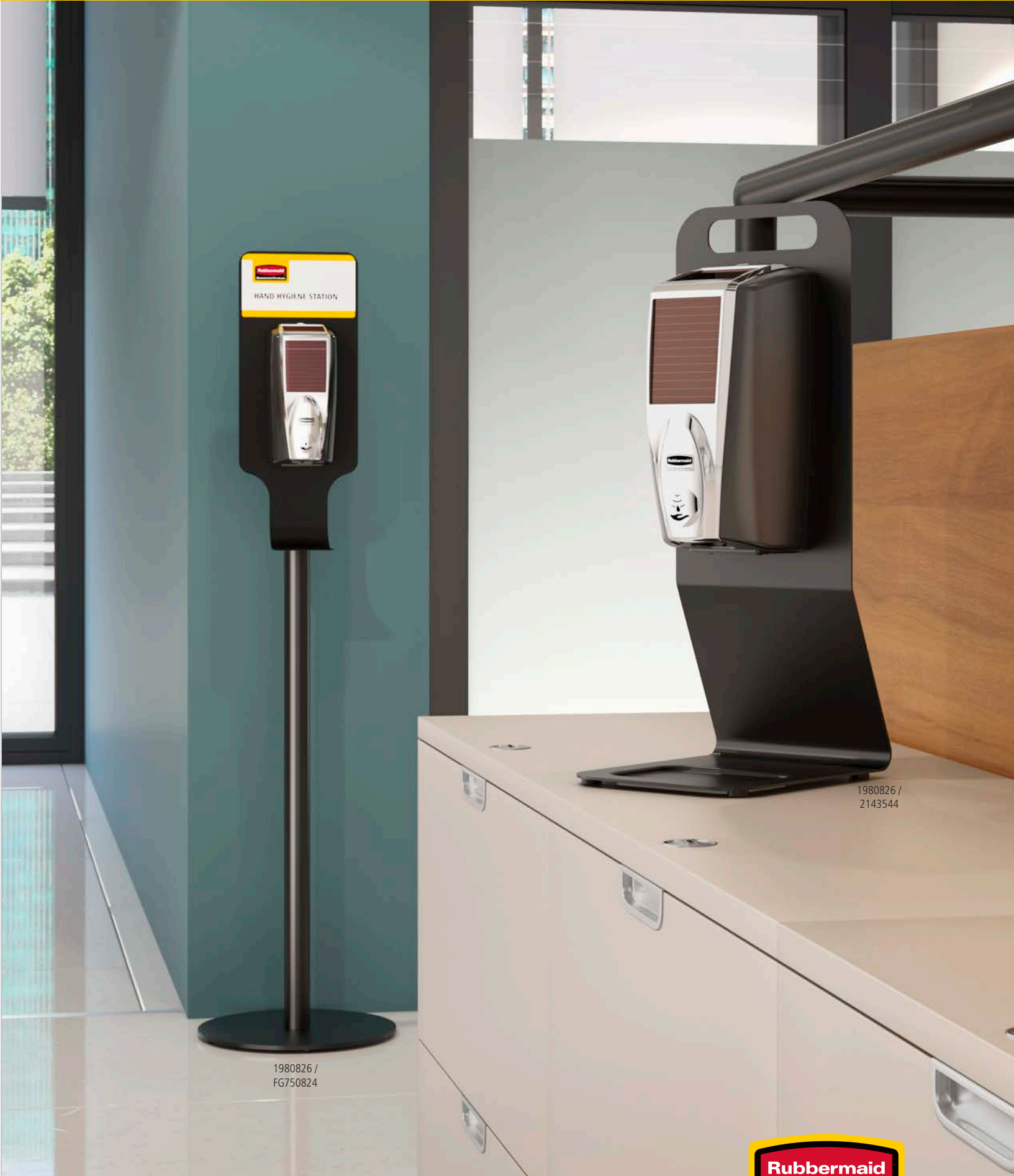
1980826 / FG750824