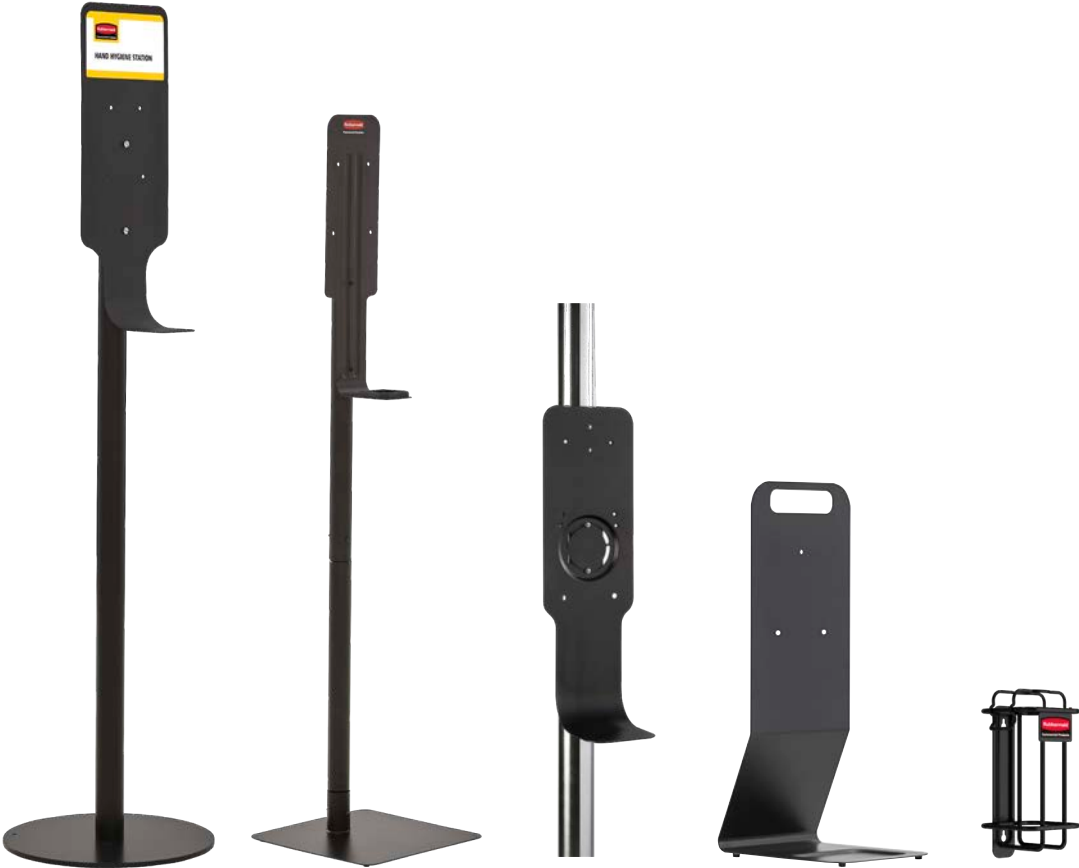
AutoFoam Premium Floor Stand