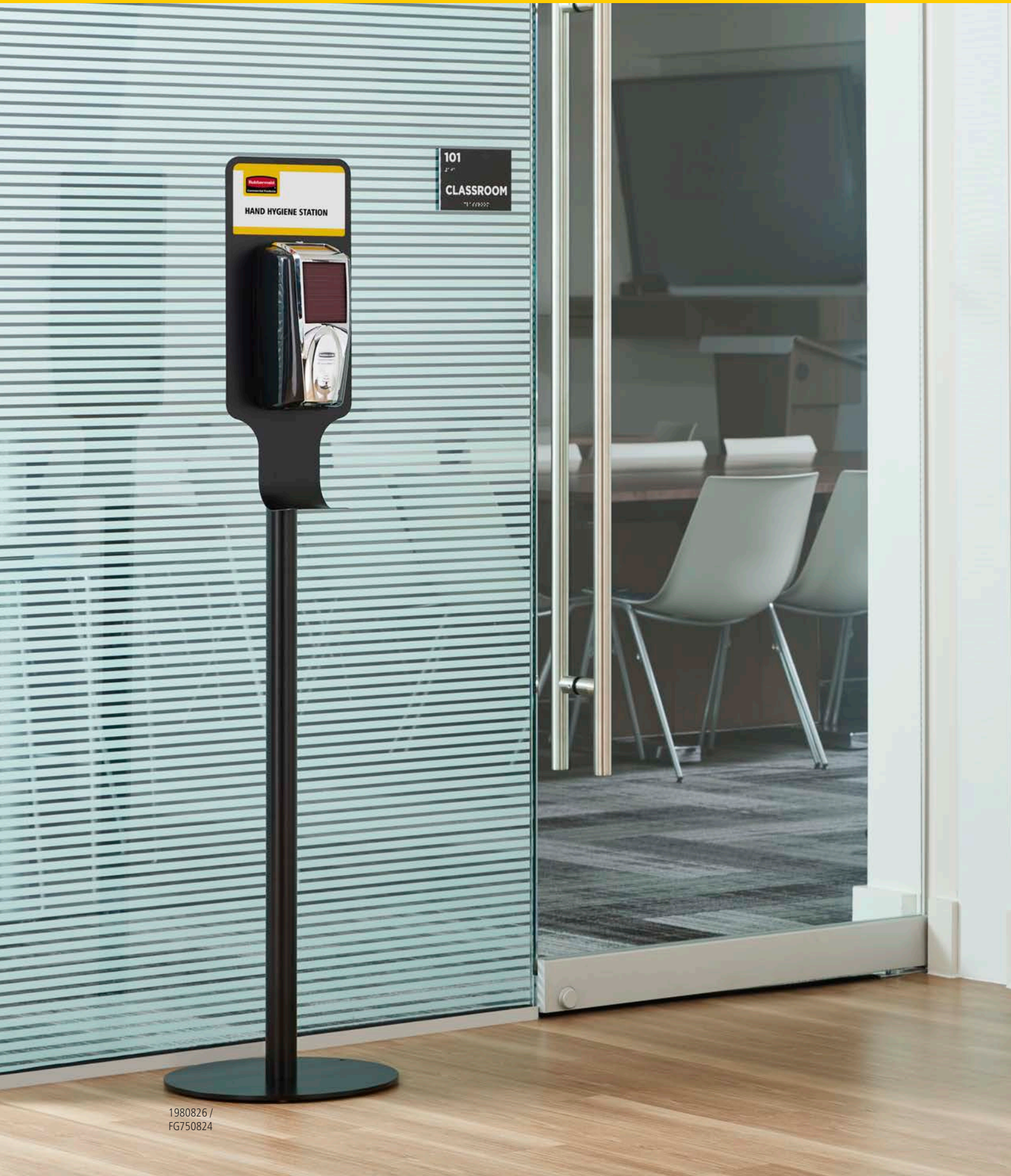
1980826 / FG750824