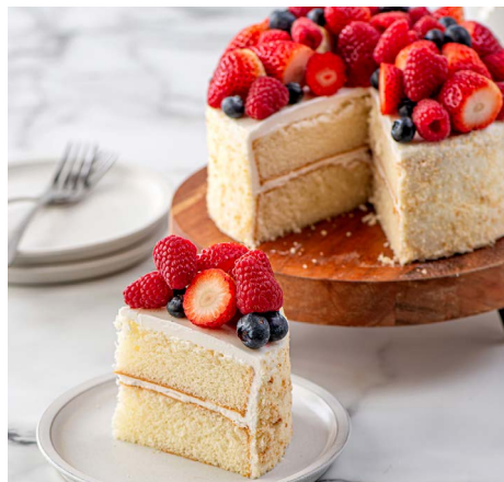
7" WHITE CAKE WITH VANILLA BUTTERCREME ICING NATURALLY & ARTIFICIALLY FLAVORED