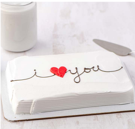
YELLOW CAKE WITH VANILLA WHIPPED ICING NATURALLY & ARTIFICIALLY FLAVORED