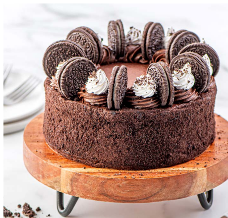
7" CHOCOLATE CAKE WITH CHOCOLATE BUTTERCREME ICING NATURALLY & ARTIFICIALLY FLAVORED