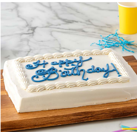
WHITE CAKE FILLED WITH WHITE BUTTERCREME