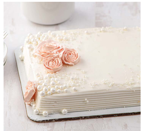
YELLOW CAKE WITH VANILLA BUTTERCREME ICING NATURALLY & ARTIFICIALLY FLAVORED