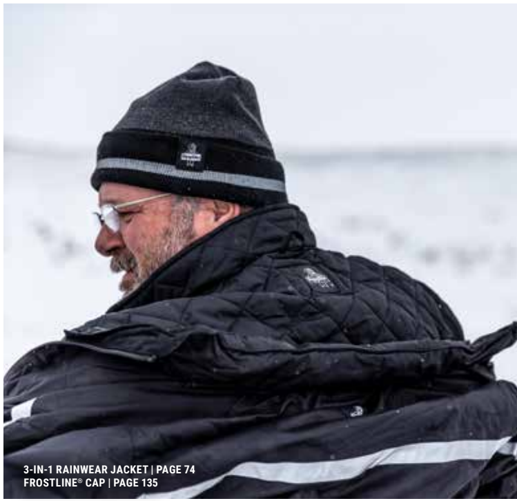
3-IN-1 RAINWEAR JACKET | PAGE 74 FROSTLINE® CAP | PAGE 135