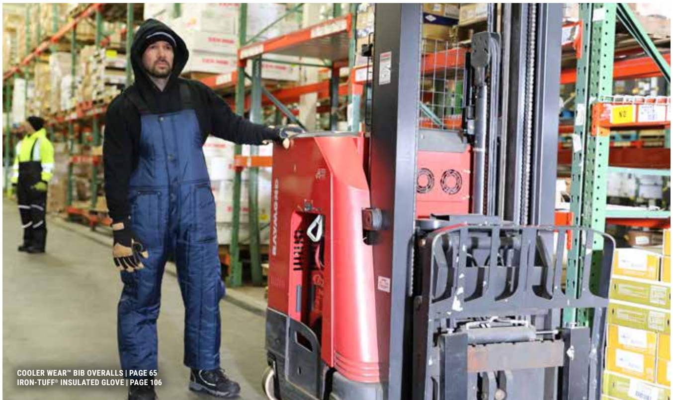
COOLER WEAR™ BIB OVERALLS | PAGE 65 IRON-TUFF® INSULATED GLOVE | PAGE 106