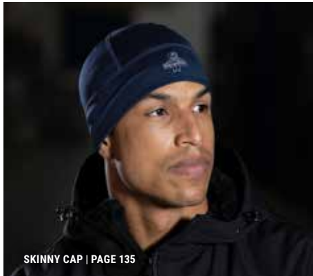
SKINNY CAP | PAGE 135