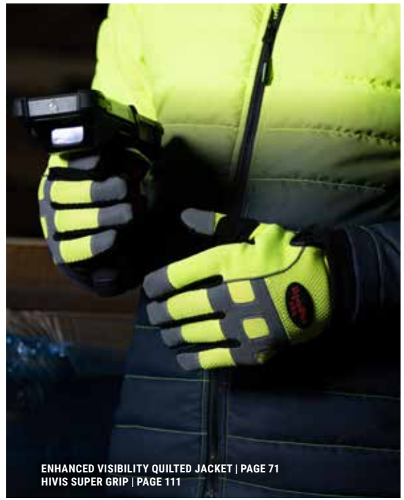
ENHANCED VISIBILITY QUILTED JACKET | PAGE 71 HIVIS SUPER GRIP | PAGE 111