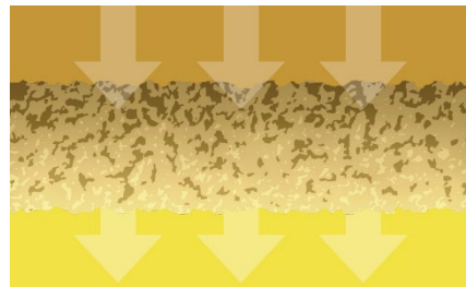
Prime Filter envelopes trap particulate AND adsorb dissolved impurities for cleaner, fresher, longer-lasting oil.