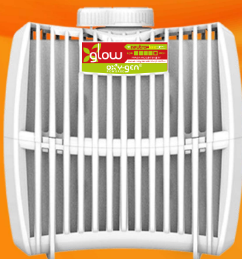
Grande Cartridge 30/60/90 Days

Clean, stylish, modern and functional design for every facility