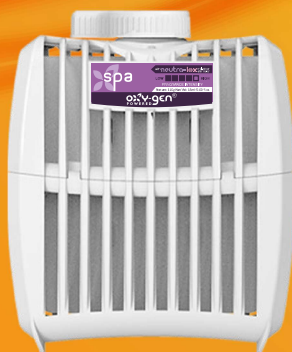
Regular Cartridge 30 Days