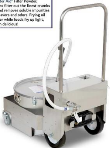
Model BD505 & model BD707 with drain filter for fryers with drain valves.

When using the MiROil Filter Machines, be sure to use Frypowder® "Antioxidant Adsorbent & Filter Aid" Filter Powder. Frypowder® helps filter out the finest crumbs and sediment and removes soluble impurities that cause off-flavors and odors. Frying oil stays fresh longer while foods fry up light, crisp, and golden delicious!