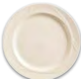
Endurance pg. 125