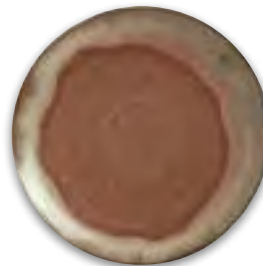
◆ Hedonite pg. 114