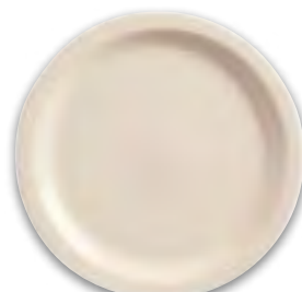
◆ Kingsmen White pg. 126