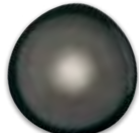
Pebblebrook – 2 colors pg. 116