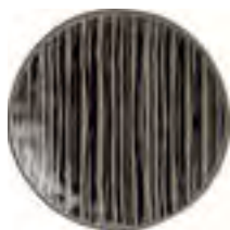
8" Salad Plate Tan No. AFAR-1T H1½ 1 doz./15# • .5 cu. ft.