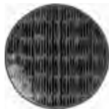
8" Salad Plate Gray No. AFAR-3G H1½ 1 doz./15# • .5 cu. ft.