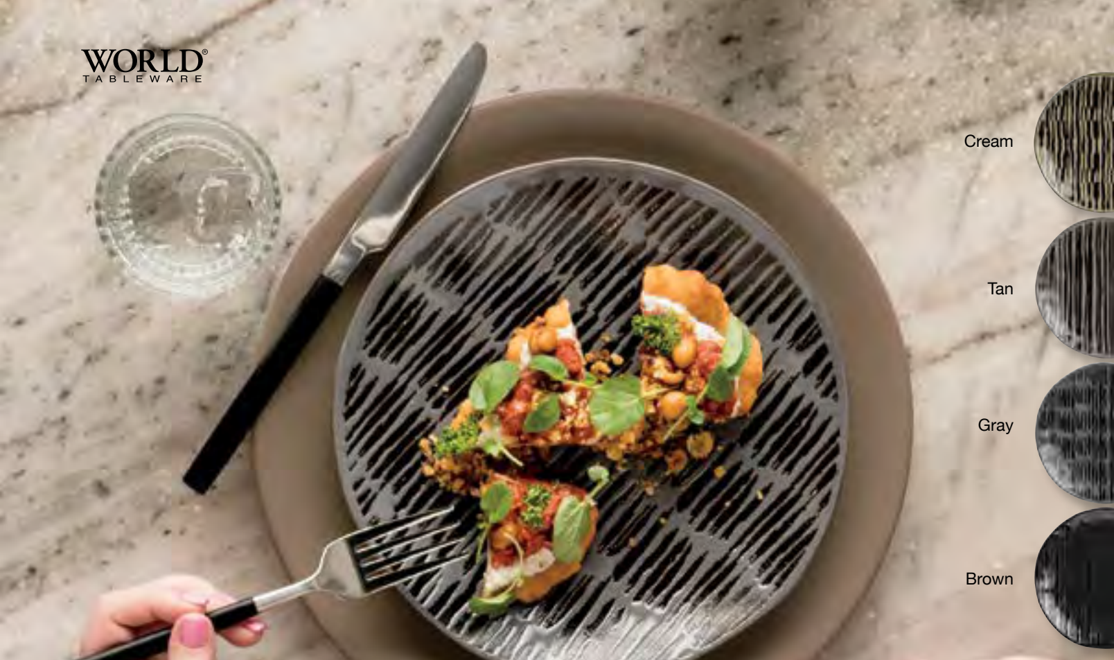
Shown: World® Afar and Driftstone dinnerware, High Rise flatware and Libbey® glassware