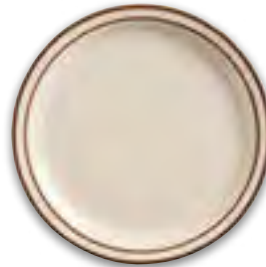
◆ Desert Sand pg. 128