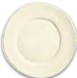
Farmhouse® – 4 colors pg. 108