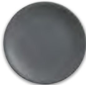
Driftstone – 5 colors pg. 100