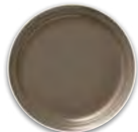
Englewood – 3 colors pg. 106