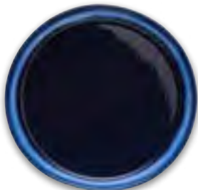
NEW ◆ Stonewash pg. 118