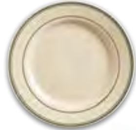
◆ Viceroy pg. 129