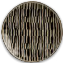
◆ Afar – 4 colors pg. 103