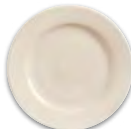
◆ Princess White pg. 127