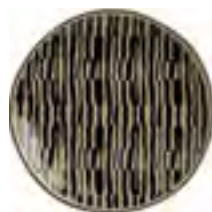
8" Salad Plate Cream No. AFAR-7C H1½ 1 doz./15# • .5 cu. ft.

Afar is screen decorated in four exotic designs, accented with a textured, dark tone.