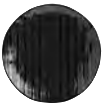
8" Salad Plate Brown No. AFAR-5B H1½ 1 doz./15# • .5 cu. ft.