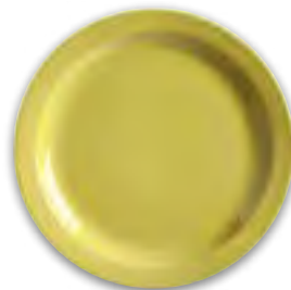
◆ Veracruz™ – 4 colors pg. 122