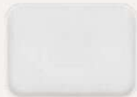
White Ceramic Tray NEW

These ceramic trays are a fantastic way to dress up your casual dining. Designed to have the shape of the aluminum trays, which have become so popular for serving; these trays create a more refined serving piece. Stackable for easy storage.