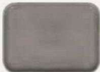
Grey Ceramic Tray NEW