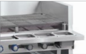
Optional stainless steel, 9¼" (248) deep work deck with a full width cut-out for sauce pans.