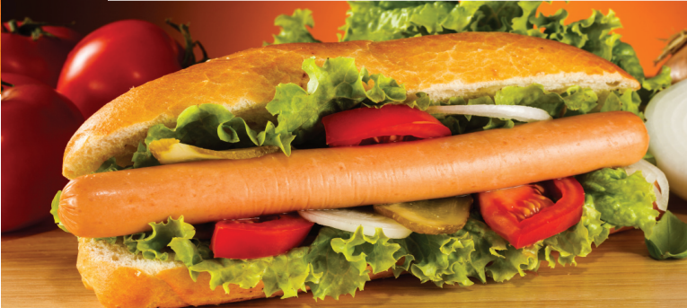
AR Series Steamers Front Opening - Self Contained Water Supply