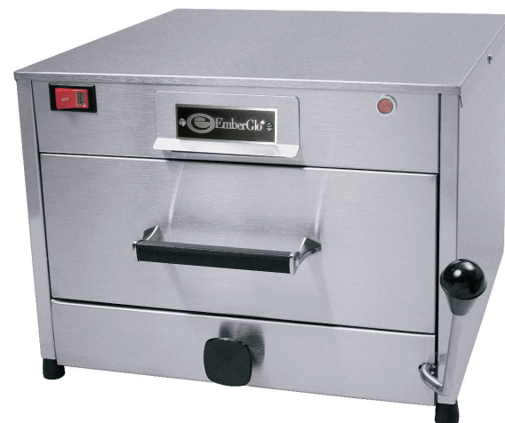
Model AR60 (Manual Pump Shown)